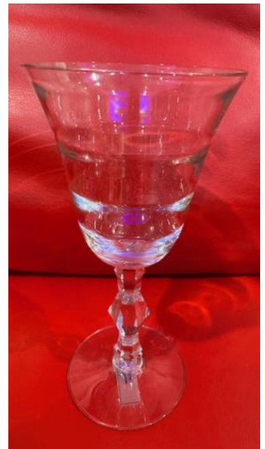
No. 4088 Polly