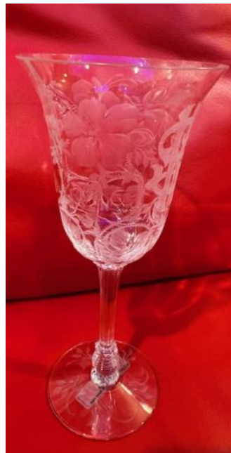
No. 4067 Loren