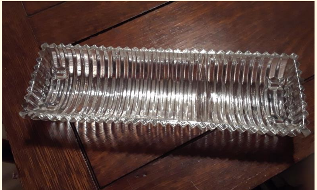
The author's first Heisey, bequeathed to him by his mother in the late 1970s: his grandmother's beautiful 12" Ridgeleigh celery and olive tray

After walking around some of the town, my parents went into an antique store. My mother saw a set of dessert plates (Cross Lined Flute) she liked and bought them for me for my upcoming birthday. We had never heard of Heisey at that time. The store owner told her about Heisey and that started our years of seeking out Heisey wherever we went. Over the ensuing years I filled a china closet full of lovely glass.