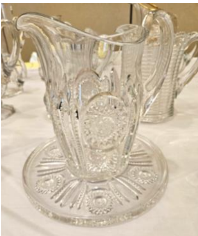
Beaded Panel and Sunburst No. 1235 w/ matching tray

Next meeting will be our May meeting at Replacements, Ltd. on May 11.