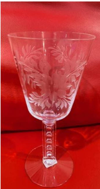
No. 5080 California