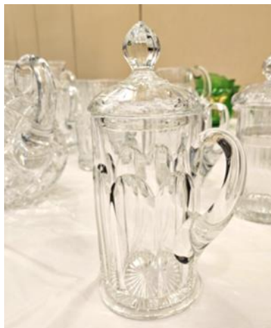
Various pitchers and jugs