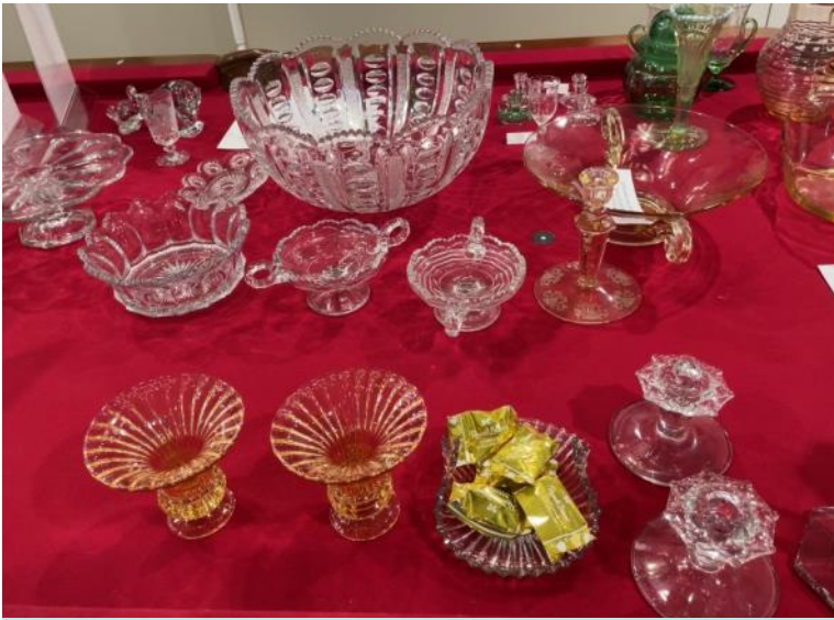
Show and tell