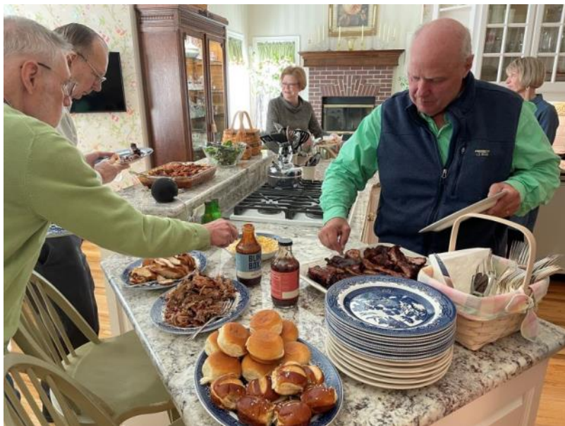
Nothing like Kansas City barbeque for lunch