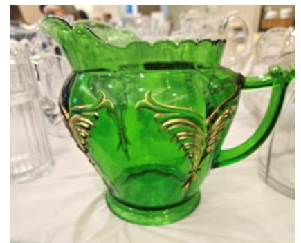
Wing Scroll, No. 1280 ½ gallon pitcher Emerald and gold trim