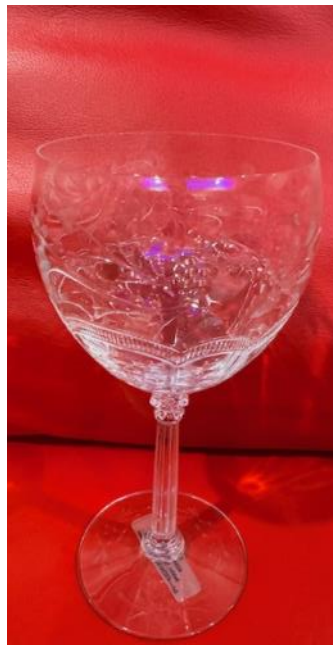
No. 5042 Corinthian