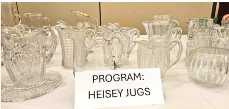
PROGRAM: HEISEY JUGS