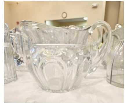
Raised Loop No. 439 jug