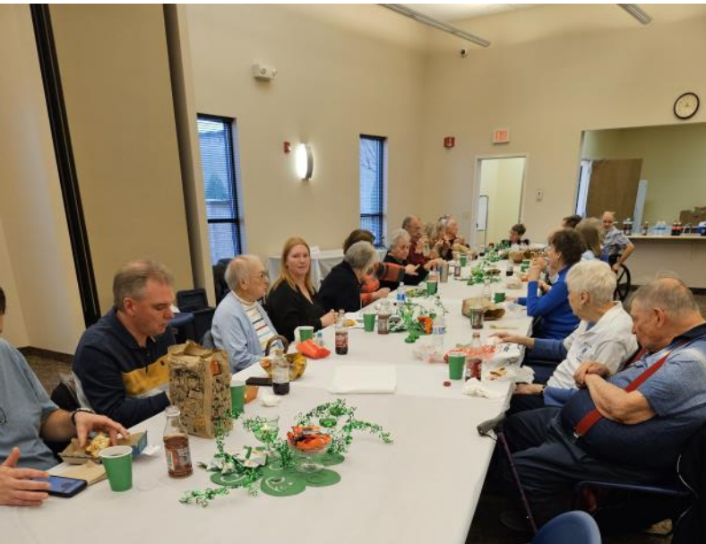
Lively discussion during lunch

Heisey used jugs, pitchers and tankards interchangeably from one pattern to another. A pitcher defined as a jug was most often used for water and came in a matching set with six or 12 water tumblers. The three common shapes are conventional, squat, and tankard. A tankard held a quart, and a smaller one was called a mug.