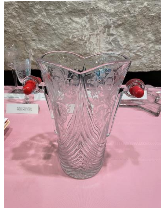
Stanhope vase with Maytime etching