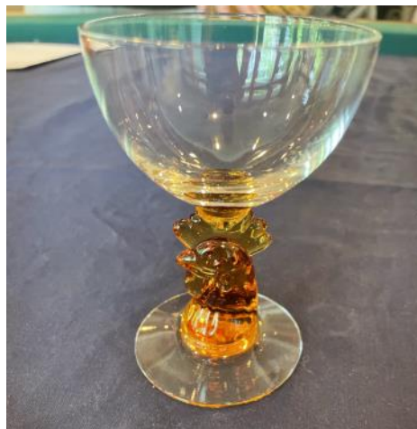
Rooster head cocktail, Sultana stem