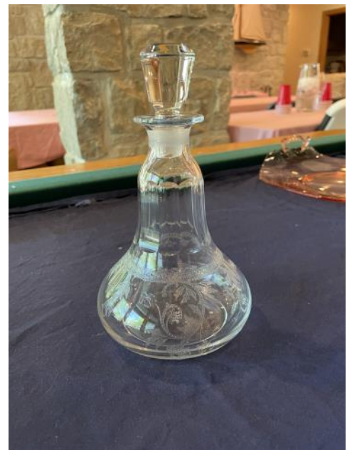
Spencer decanter with Fontenac etching