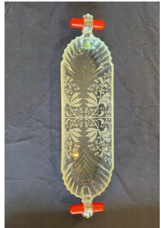
Stanhope celery with red rods and Maytime etching