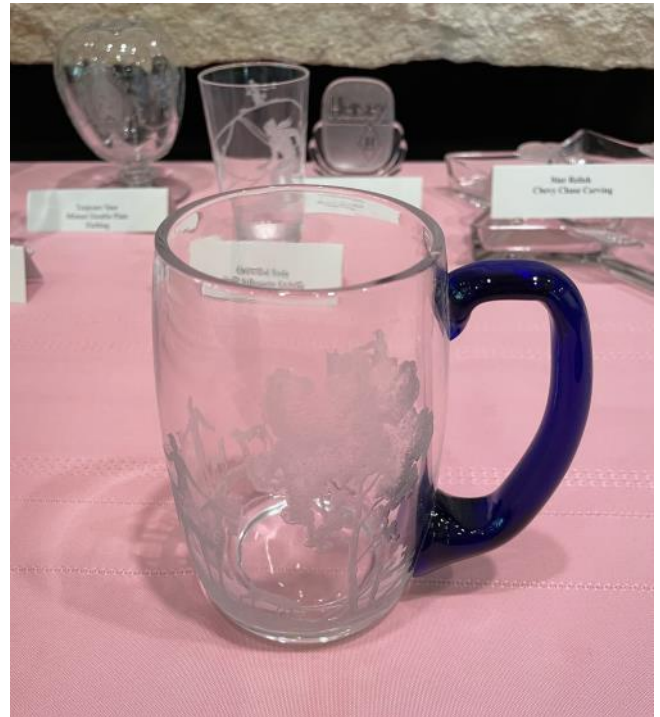
A cobalt handled beer mug with Cobalt handle and Fox Chase etching from Lehi German's collection

We adjourned for dessert – I think the blueberry pie a la mode was the #1 choice. Thanks to Chris and Lehi for hosting another super Great Plains club meeting.