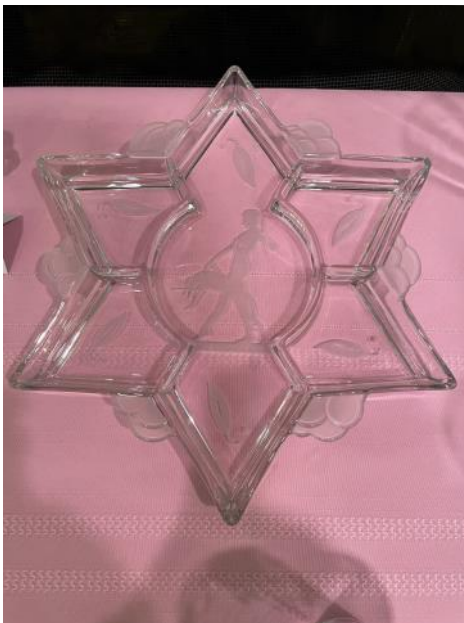
Star relish/Chevy Chase carving