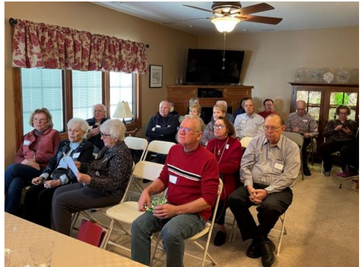
Club members and guests await the start of the meeting.