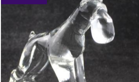
Airedale on the bustoff