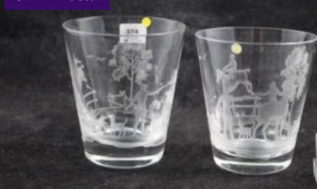
Oakwood old fashion with 462 Fox Chase etch