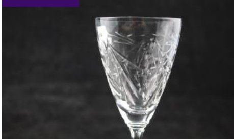
Duquesne wine with 832 Continental cut