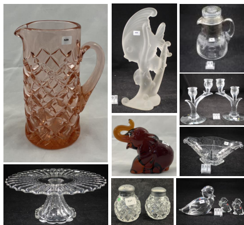
On the cover: A close look at several auction items selling at the 2022 All-Heisey Spring Benefit Auction

2022 Annual National Heisey Convention June 15-18, 2022 Newark, Ohio