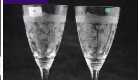
Wabash wine 2 1/2-OZ with 440 Frontenac etch

Up-close details of select glass available at the 2022 All-Heisey Spring Benefit auction.