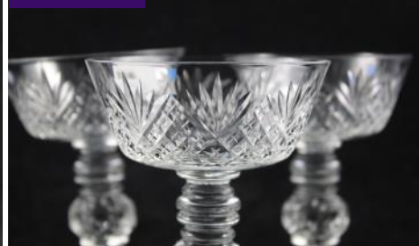
Spanish champagne with Unk Waterford-like cut