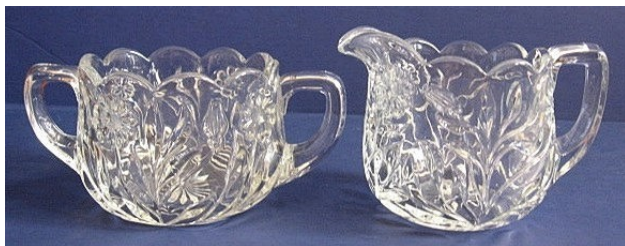
Fig. 3: 427 Daisy and Leaves cream and sugar