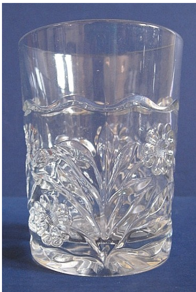
Fig. 7: 427 Daisy and Leaves tumbler

Little information has been discovered about the other pressed botanical designs made around this time. However, they can be definitely identified as Heisey products, because they are marked with the Diamond H. All are known in Crystal only.