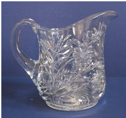
Fig. 1: 427 Daisy and Leaves half gallon jug

One pressed botanical pattern, the 427 line, called "Daisy and Leaves" by collectors, appeared in one Heisey price list, from 1910, and in one catalog, from 1911. Its production period is estimated to be from about 1909 to 1912. The shapes of the items in the pattern are similar to those of the Colonial style glassware being made at that time by Heisey, but instead of the panels and flutes of the Colonial glassware, the 427 line has a pressed design of flowers, buds, and leaves.