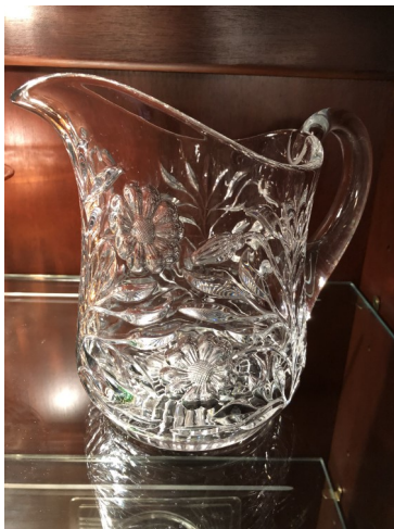
#427 Daisy and Leaves half-gallon jug made between 1911 and 1913.