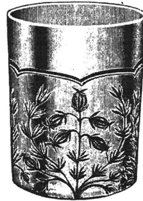
#435 - Tumbler Ground Bottom