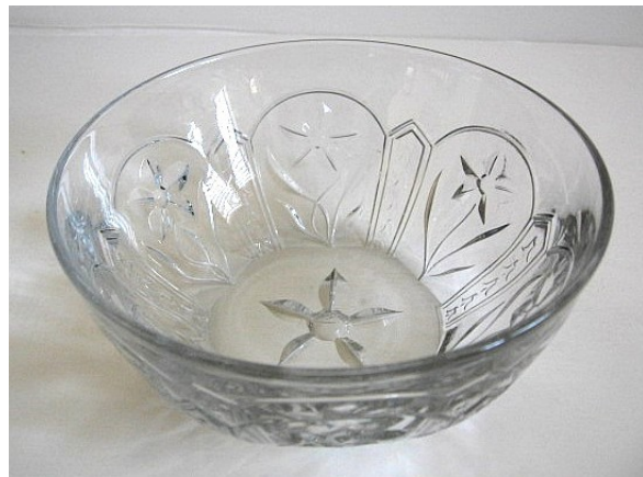
Fig. 15: 5½" nappy similar to 7011 Daffodil or 8012 Paneled Daffodil

The 7126 Pussy Willow vase, not shown here, is a swung vase in a form similar to the 427 Daisy and Leaves swung vase shown in Figure 9.