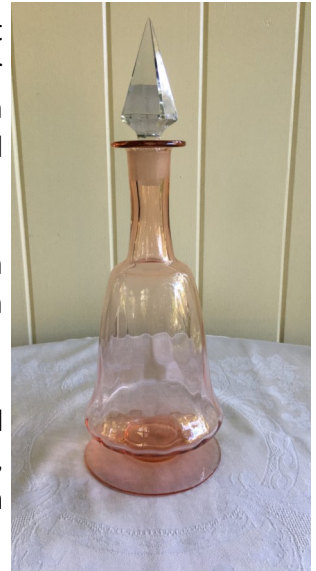
#4027 Christos decanter in Flamingo with crystal stopper made between 1925 and 1944.