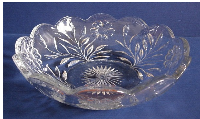
Fig. 2: 427 Daisy and Leaves 9½" shallow nappy