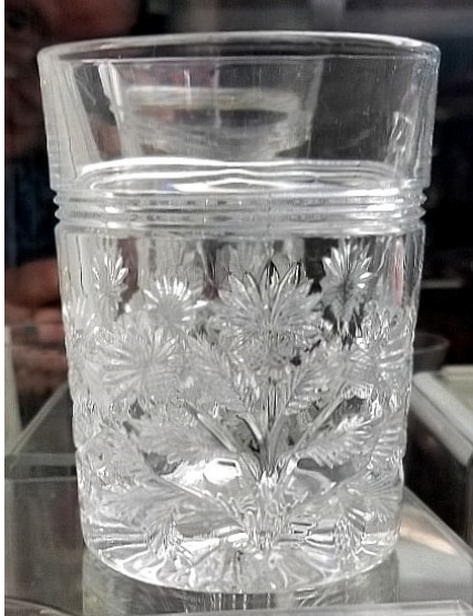
Fig. 14: 8003 Thistle tumbler

Two remarkably similar, and confusing, items appear in Figure 16. The photo caption uses the identifications in the new edition of Vogel (volume 2, page 117). The examples of both designs on display at the National Heisey Glass Museum are identified as 8007 Daisy Scroll. Plates and nappies were made in both designs. (Continued top page 16)