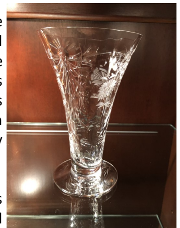
#3368 Albemarle 12-ounce footed soda or iced tea in crystal with #867 Chateau cutting.