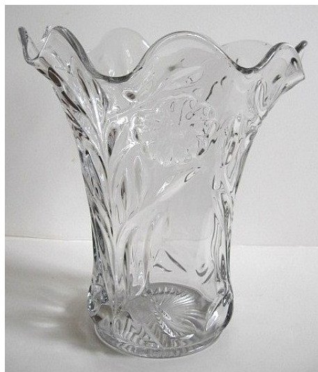
Fig. 8: 51-440 Daisy and Leaves 10½" swung vase