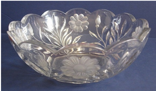
Fig. 5: 427 Daisy and Leaves 8" nappy, satin finish on flowers and buds

The flowers and buds are sometimes found with a satin finish. The pattern was made in Crystal only, and all items are marked with the Diamond H. The pattern included three sizes of nappies, three sizes of shallow nappies, a finger bowl, a tumbler, an ice tea tumbler, two half gallon jugs, a hotel cream and sugar, a 9" vase, and swung vases in sizes from 7½" to 48" (Fig. 1-8). The swung vases are numbered from 50-440 to 59-440, based on their height. From 1917 to 1923, Heisey made the 480 fruit or centerpiece basket with a pressed pattern similar to 427 Daisy and Leaves, but lacking the buds (Fig. 9). The basket is often found with over-cutting on the pressed floral design.