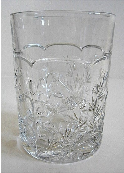
Fig. 10: 435 Juniper tumbler