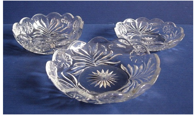
Fig. 6: 427 Daisy and Leaves small nappies: 4½", 4¾" shallow, 5½" shallow

Because the 435 Juniper tumbler (Fig. 10) appeared in one Heisey catalog (circa 1910), its original Heisey pattern number is known (it was named by HCA). There may be two versions of this tumbler. In the catalogue drawing, there are fronds on the berries that do not appear on the tumbler in the photo (Fig. 11). It is also possible the drawing is not accurate.