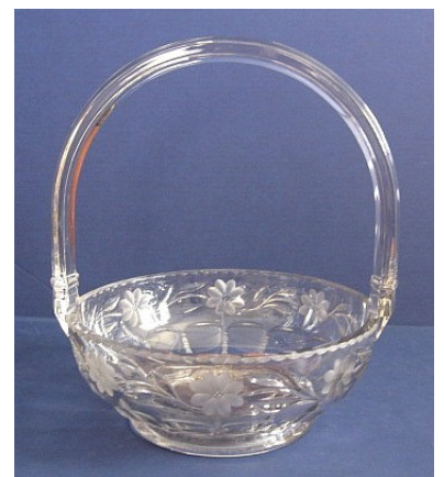
Fig. 9: 480 Daisy and Leaves basket with overcutting on pressed design