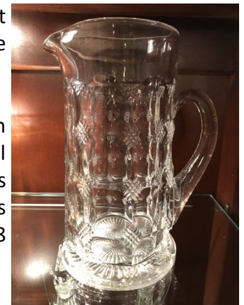
#385 Grid and Square half-gallon jug made between 1909 and 1913

#427 Daisy and Leaves half-gallon jug. This piece was part of a small pattern made between 1911 and 1913 that included a tumbler, an iced tea, hotel cream and sugar, several nappies, finger bowl and vases and two 9-inch vases. There is also a Daisy and Leaves swung vase, #54-440, with sizes ranging from 7 to 48 inches.