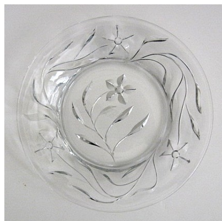
Fig. 13: 7098 Cut Daisy 8" plate