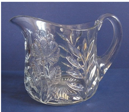
Fig. 12: 8019 Oriental Poppy pitcher (named 7061 Iris or Leaf and Iris by Vogel)

The 5½" nappy shown in Figure 15 has a pressed design similar to 8012 Paneled Daffodil (named 7011 Daffodil by Vogel). The nappy shown in Vogel, book 4, page 64 (volume 2, page 117 in the new edition),