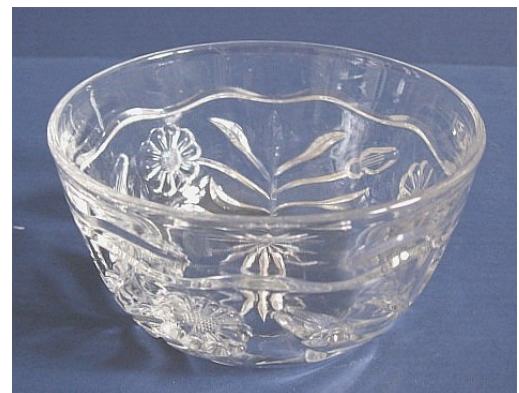
Fig. 4: 427 Daisy and Leaves finger bowl