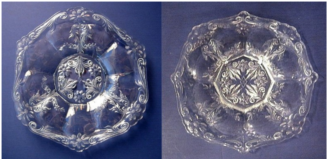
Fig. 16: 7099 Three Scroll 12" plate (left) and 8007 Daisy Scroll 6½" plate (right)

The 7126 Pussy Willow vase, not shown here, is a swung vase in a form similar to the 427 Daisy and Leaves swung vase shown in Figure 9.