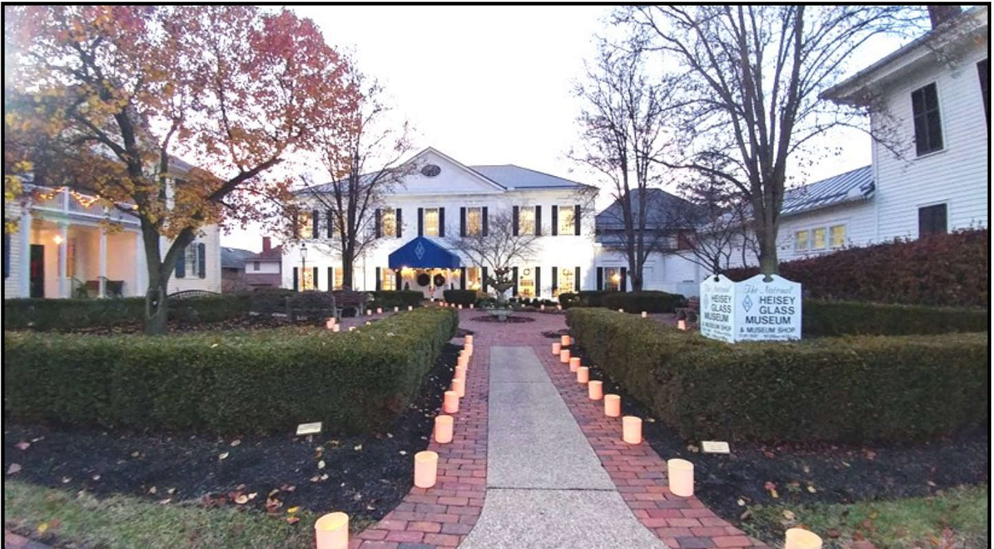
As dusk began to fall at the Museum Open House, luminaries lit the path for members and guests as they entered the Museum for an evening of fellowship and fun.

Come at your leisure to enjoy more than 6,000 pieces of glassware produced by A.H. Heisey and Company from 1896-1957. Hundreds of patterns are featured in all production colors. Rare and experimental items are included as well. Facilities are air-conditioned and handicapped accessible. The opinions expressed in articles in HEISEY NEWS are those of the authors and not necessarily those of the organization. The Editorial Staff reserves the right to edit, with or without the consent of the author, or to refuse any material submitted for publication.