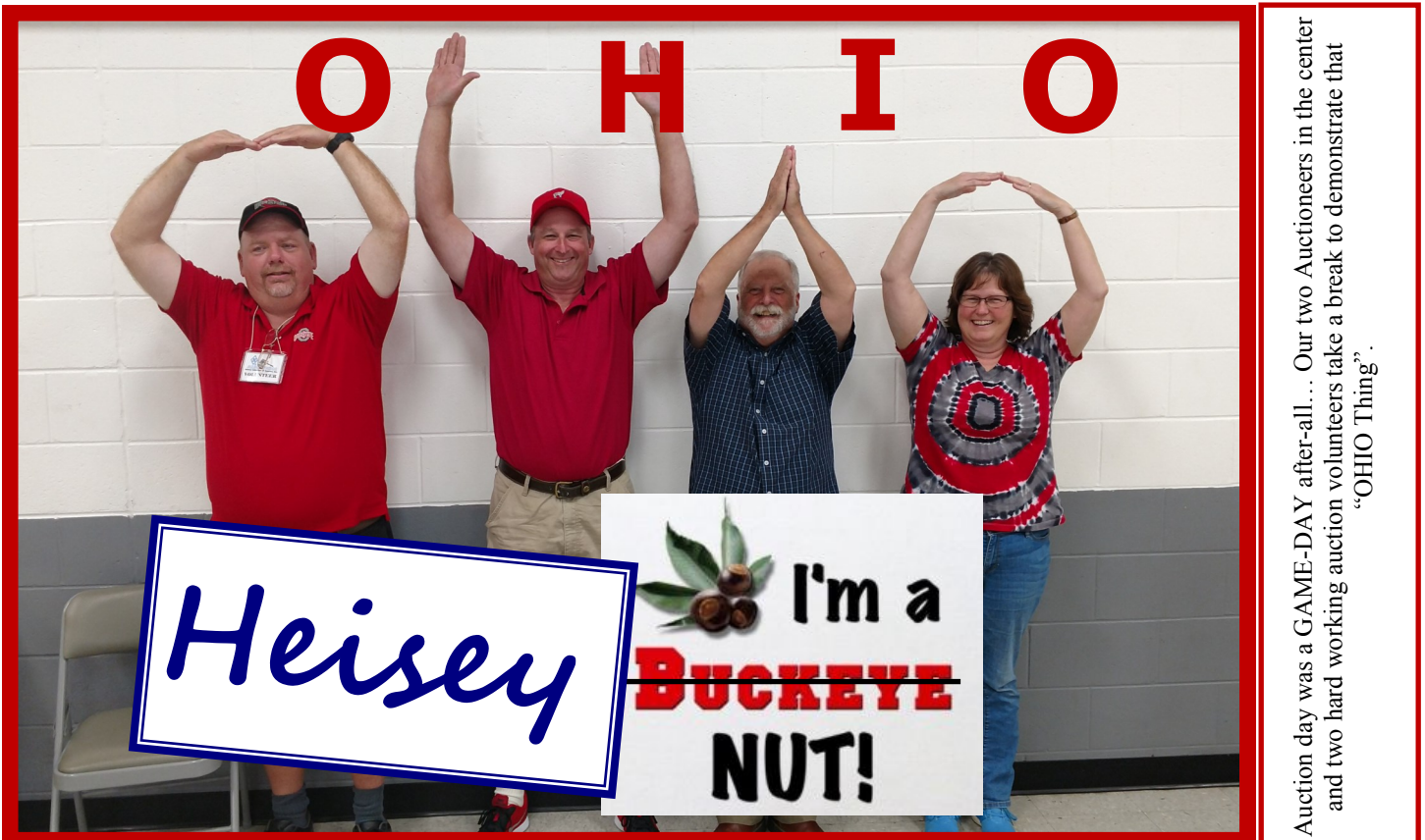
Auction day was a GAME-DAY after-all... Our two Auctioneers in the center and two hard working auction volunteers take a break to demonstrate that "OHIO Thing".

Come at your leisure to enjoy more than 6,000 pieces of glassware produced by A.H. Heisey and Company from 1896-1957. Hundreds of patterns are featured in all production colors. Rare and experimental items are included as well. Facilities are air-conditioned and handicapped accessible. The opinions expressed in articles in HEISEY NEWS are those of the authors and not necessarily those of the organization. The Editorial Staff reserves the right to edit, with or without the consent of the author, or to refuse any material submitted for publication.