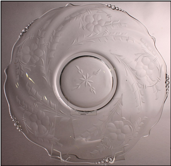
Fig. 2. #1519 Waverly sandwich plate

Apparently, Heisey at first used #5022 as a companion blown line for #1519, breaking with their usual custom. The #5022 stems are the ones we know as Graceful, but the line was first called Oceanic, at just the same time that #1519 was also called Oceanic. #5022 under either name had the ordinary, straight-up-and-down, blown Wide Optic. Optically speaking, therefore, #5022 didn't do much to get in the spirit of its pressed #1519 Oceanic distant relative.