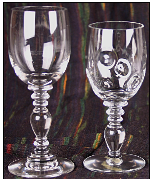
Fig. 8. #4090 Coventry wine (left) and #4004 Polkadot (formerly Ludwig) wine.

Spot Optic may have been made in a different way when it came to the plates for Impromptu. There are 12 spots arranged in two ranks of six around the rim of the plate. The "belly-button" effect is often almost completely obscured on the underside of the plate (what would have been the outside surface). On the upper (inside)