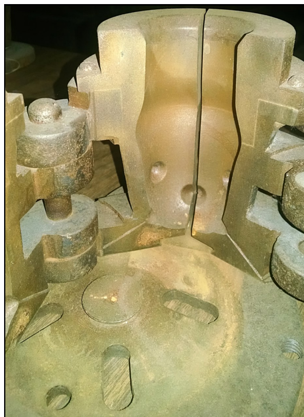
Fig. 9. The mysterious Bird’s Eye Optic mould.

The war brought stylistic innovation to a near-halt. After the recovery of the late 1940’s, A.H. Heisey & Co. were moved to create even more optics. Next time we’ll see how they ushered in the 1950’s. What could top polkadots?