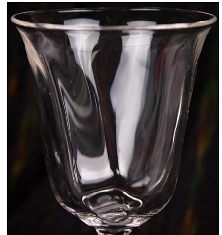
Fig. 5. The bowl of #8109 Elizabeth with external pressed Elizabeth Optic. A wide panel of the optic is on the right, a narrow one on the left.