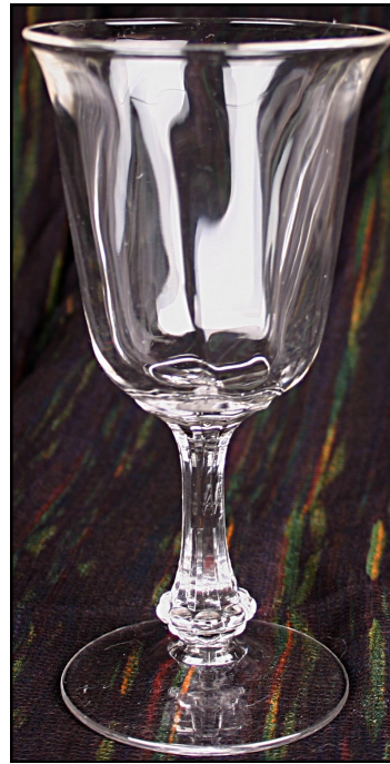
Fig. 4. #8109 Elizabeth goblet with Elizabeth Optic. One of the optic's narrow panels faces us, with a wide panel on either side of the narrow one.

In a complete departure from its previous optics, in 1941 Heisey introduced what they called the Spot Optic . This is the optic used on the pattern #4004, called Polkadot all through the 1940's, but re-named Impromptu in the 1950's (fig. 6). This is not an ordinary optic in appearance or manufacture. Each spot looks very much like a navel; in fact, Heisey workers called this the Belly-Button Optic. The optic looks as though each spot was made by pressing a small ring inward from the outside while simultaneously pressing a blunt spike outward from the inside. I'm not saying that is actually how it was made; it just looks like it could have been made that way.