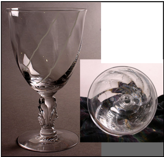
Fig. 3. #5019 Waverly goblet, Wide Swirl Optic sweeping upward from left to right (retouched for emphasis); inset shows optic looking into the mouth of the goblet

When #1519 was revived in 1949 and renamed Waverly, Heisey finally offered a true companion blown line, #5019. The #5019 Waverly stems (never called anything but Waverly, thank goodness) used an optic we've seen before, the 10-paneled blown Wide Swirl Optic (fig. 3). You may remember that one from Janice vases or Koors barware, for instance. It is much the same this time, twisted to the right as in Koors but to a lesser degree of twisting, still with its 10 panels intact.