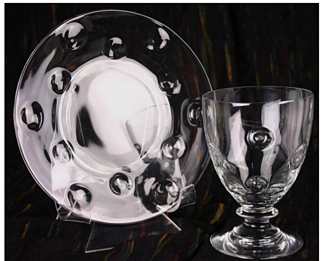
Fig. 6. #4004 Impromptu (Polkadot) plate and goblet