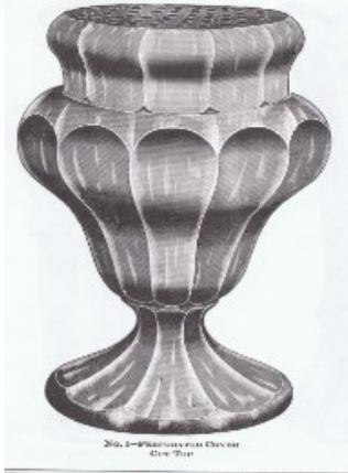
#352 Flat Panel vases #1 and #5