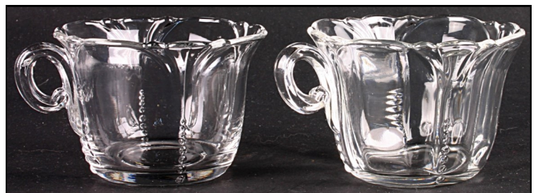
Fig. 1. Custards in #1401 Empress (left, no optic) and #1509 Queen Ann (pressed Wide Swirl optic)

The Wide Swirl Optic, being pressed, was designed individually for every piece that used it. Rather than the nice, regular panels of earlier optics, the Wide Swirl Optic was made up of large, seemingly irregular undulations on the inside of the glass. Once you've seen the difference between a crystal Empress piece without an optic and its wide-swirled counterpart in Queen Ann (fig. 1), you'll be able to tell which is which at a glance.