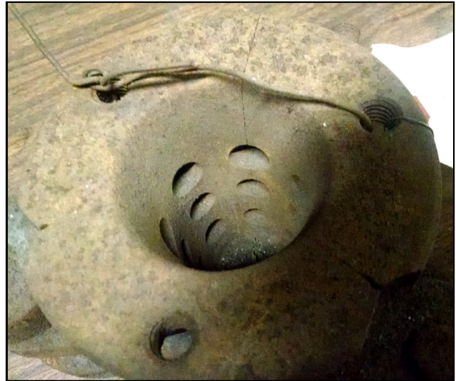
Fig. 7. Spot Optic mould

In 1949 only, a one-ounce cordial was listed for the Polkadot pattern, just before the name was changed to Impromptu. If the cordial has ever been seen, I haven't found reports of it. The