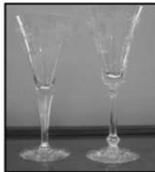
4060 Ridgeleigh & 3368 Albemarle