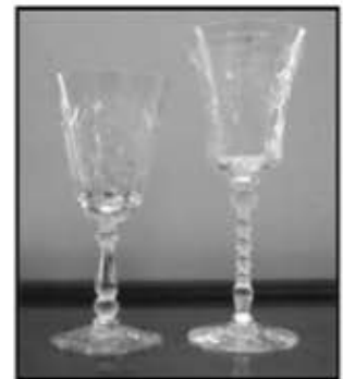
3408 Jamestown & 3411 Monte Cristo

A 20 Sheffield 7" candlestick was also purchased. This candlestick comes in six sizes, with the 9" version with a Moongleam top being the hardest to find (although none of them is easy to locate). The 23 Sheffield (Standard) is a very similar candlestick, the difference being that the number 20 has a tapered column while the number 23 has a straight column.