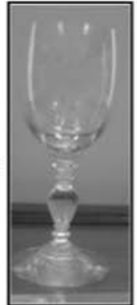
Coventry Goblet (above) and with detail etching (below)