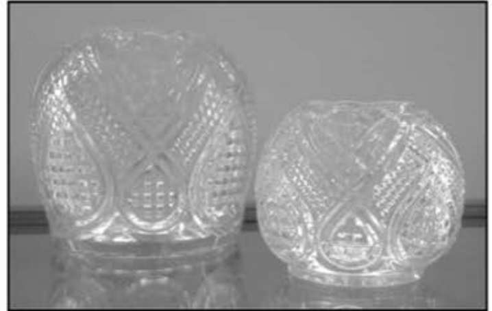
1205 Fancy Loop Rose Bowls