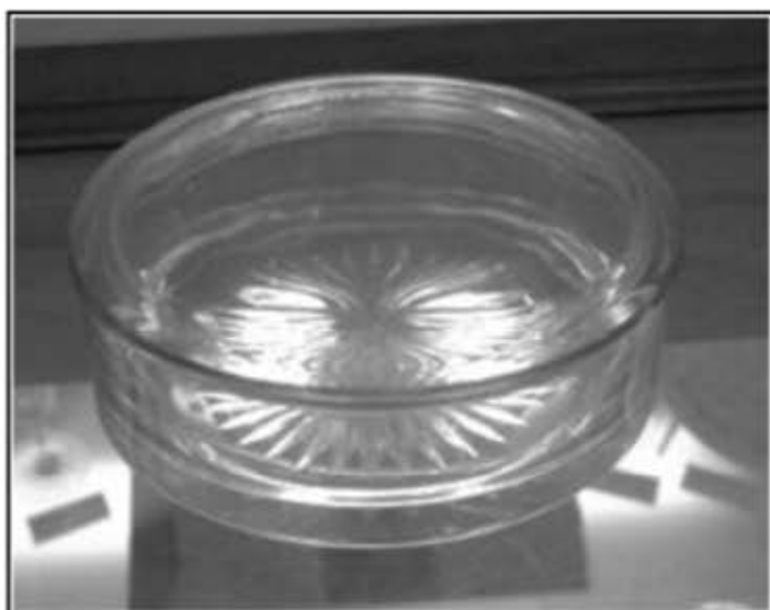
1183 Revere 5" Candy Box

likely to be taken for a puff. The rounded lid with no finial would make the lid an easy piece to be broken.