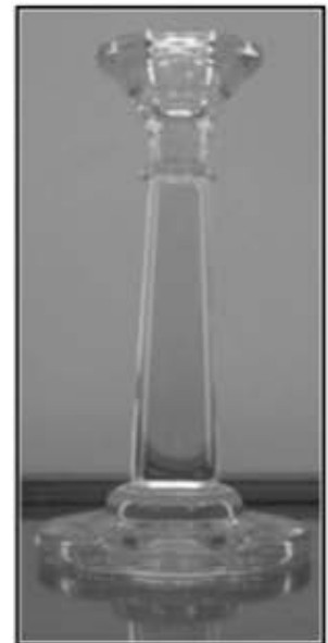
20 Sheffield 7" Candlestick

A 20 Sheffield 7" candlestick was also purchased. This candlestick comes in six sizes, with the 9" version with a Moongleam top being the hardest to find (although none of them is easy to locate). The 23 Sheffield (Standard) is a very similar candlestick, the difference being that the number 20 has a tapered column while the number 23 has a straight column.