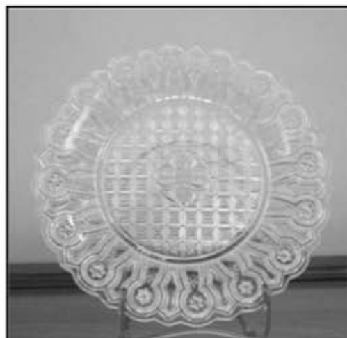
8071 Sandwich Hairpin

The Acquisition Committee also made a few purchases of items to enhance our collection. An 8071 Sandwich Hairpin 8" plate was the first item. This is one of a series of Sandwich Glass inspired plates that were developed in the mid-1920s. This one was not shown in any company catalogues and is so rarely seen that it is felt that it was never put into regular production; instead it was only developed as a prototype and very few were ever made.