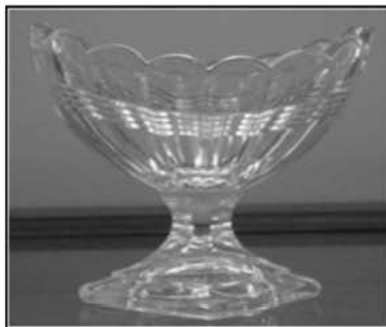
8025 Banded Diamond Compote