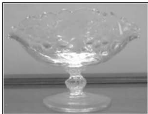
1519 Waverly Oval Nut Compote 965 Narcissus Cut