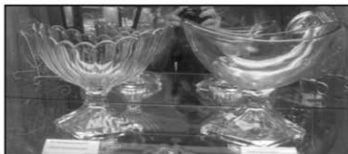
8037 Fluted Diamond and Unknown Pattern 8" Compote

The Acquisition Committee also made a few purchases of items to enhance our collection. An 8071 Sandwich Hairpin 8" plate was the first item. This is one of a series of Sandwich Glass inspired plates that were developed in the mid-1920s. This one was not shown in any company catalogues and is so rarely seen that it is felt that it was never put into regular production; instead it was only developed as a prototype and very few were ever made.