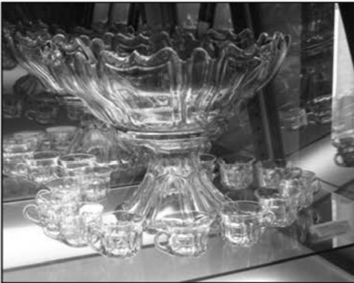
365 Old Queen Anne Flared Punch Bowl