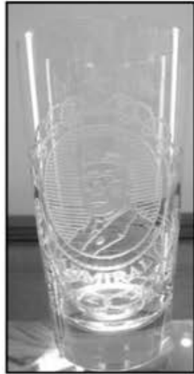
2401 Oakwood with Admiralty Etch

The second purchase was a 2401 Oakwood 12 ounce soda with Admiralty deep plate etch. The Admiralty etch was not known at the time of the production of the etching book so you will not find it listed in that reference. It was probably done for a specific customer. The etch is of an imposing figure in a naval uniform within an oval frame, under the frame is the caption "Admiral." A variant of 3 Motor Boat etch is used on the remainder of the piece.