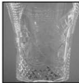
Detail Monte Cristo