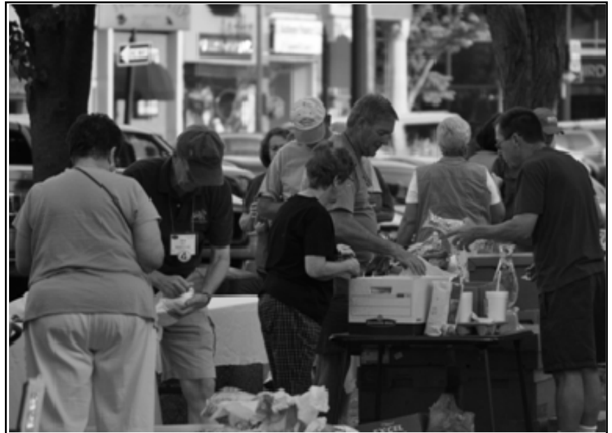
The All Glass Flea Market on the Square is a beloved event that allows convention participants an opportunity to seek out treasures in the historical setting of the downtown Newark square. It's a leisurely way to spend the morning of the final day of convention.