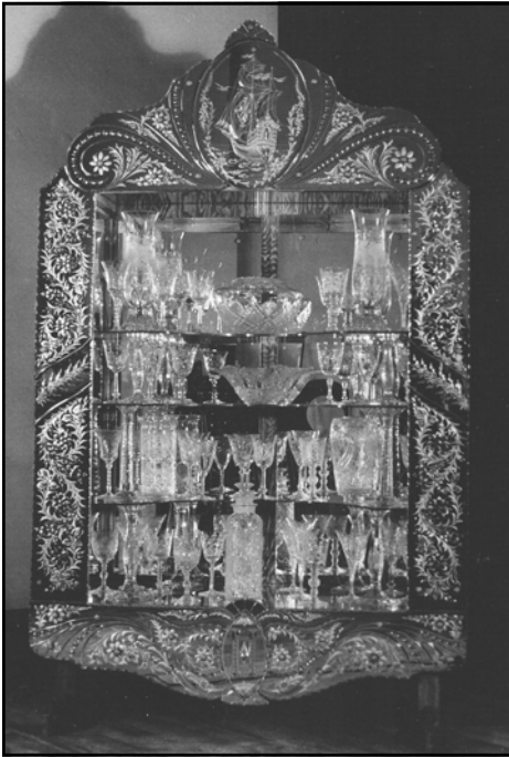
Pictured left, as displayed during a final appearance under the direction of A. H. Heisey and Company

Newspaper accounts made much of this insurance, and the resulting publicity played up the value of the glass.