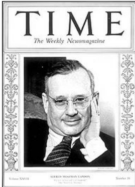
Republican Presidential Candidate Alf Landon