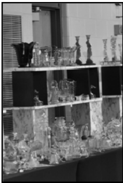
Adena Hall of OSU-Newark is a cavernous place, but it was filled to the brim during the three-day Glass Show & Sale , featuring Elegant Glass Dealers from across the United States.