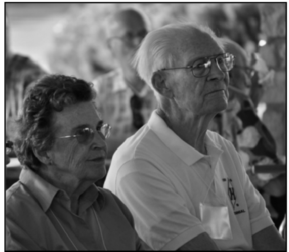
Following registration, convention participants met and mingled at the Welcome BBQ , an outdoor event held at Rotary Park. After dinner, former Heisey Museum and Factory employees were recognized; several of them are pictured at top left. The other photos on this page are participants at the BBQ.