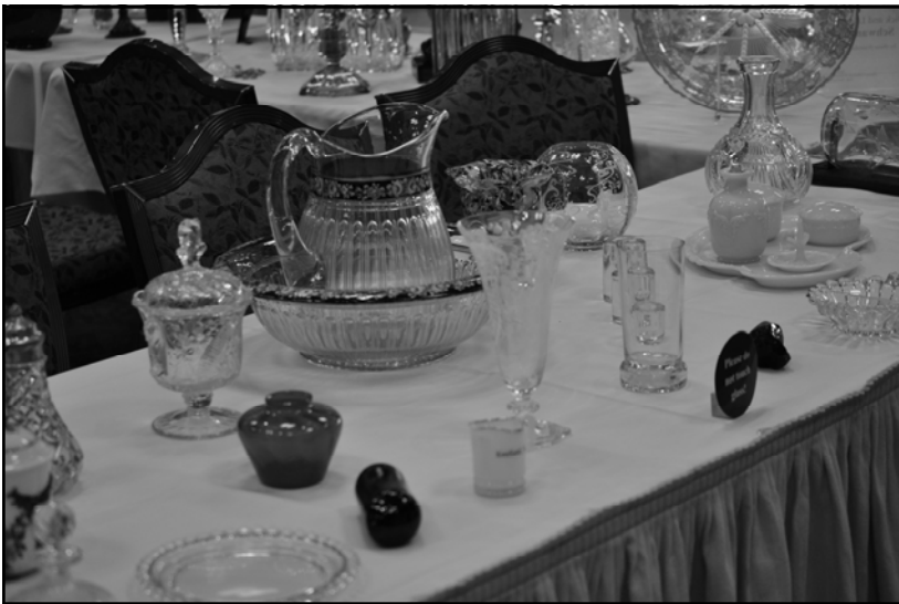
Participants at “The Legacy of Heisey Glass” Endowment Benefit Brunch especially enjoyed looking at the beautiful pieces of glass on display. Several HCA members shared items from their personal collections; see the story on page 8 for a complete listing of their names.