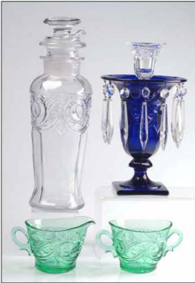
1405 Ipswich – See Story Page 5