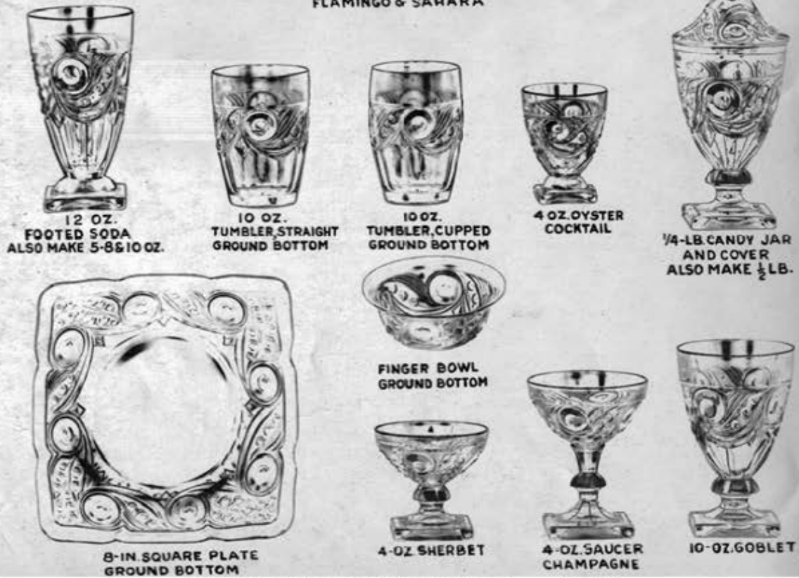
1405 IPSWICH – Cat 109 Addendum – P 166