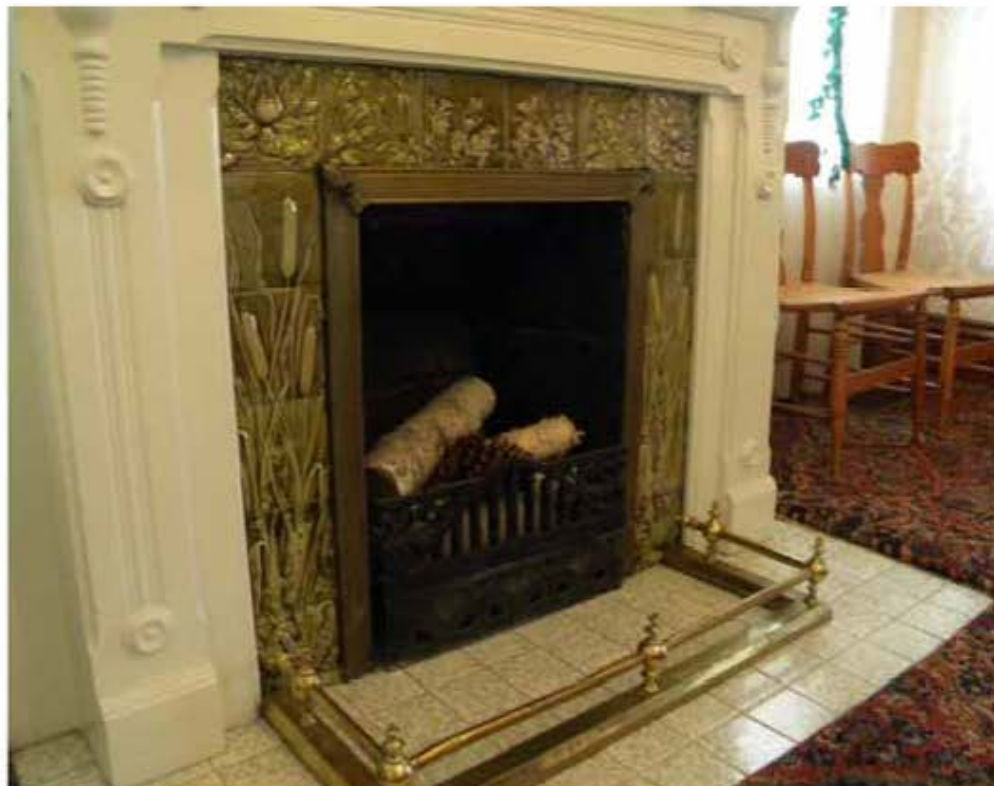
Fireplace from King House Dining Room – See Story Page 11