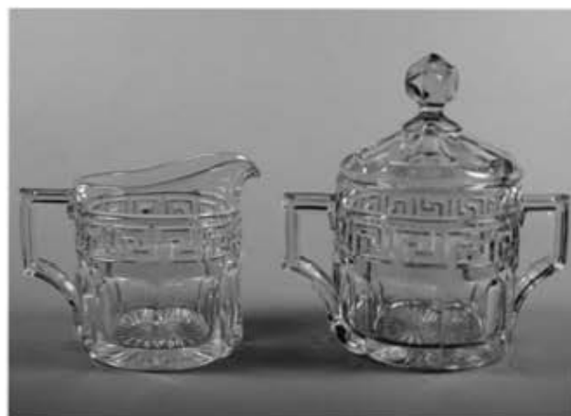
Figure 3 – Table Set

Among the first pieces of Greek Key for many collectors are the oval hotel cream and sugar. The oval shape comes in two sizes (Fig. 1). While the hotel size is the most common of all the Greek Key sets, the individual ones are the least common, difficult but not truly rare. Both oval sets are toed in, having slightly larger bases than tops (ignoring the cream spouts). There are two round sets, in a hotel size (Fig. 2) and a larger round set intended for home table use (Fig. 3). Both round sets are straight up and down, as wide at the top as at the bottom. Neither of them is as common as the oval hotels, but neither would be counted as especially difficult. All shapes and sizes are of heavy glass, with thick bottoms that one could almost call shammed. All I've seen are marked. I have seen one individual cream that was dated. I'm sure, though, that other dated creams or sugars are out there. (The date is 9/12/11,