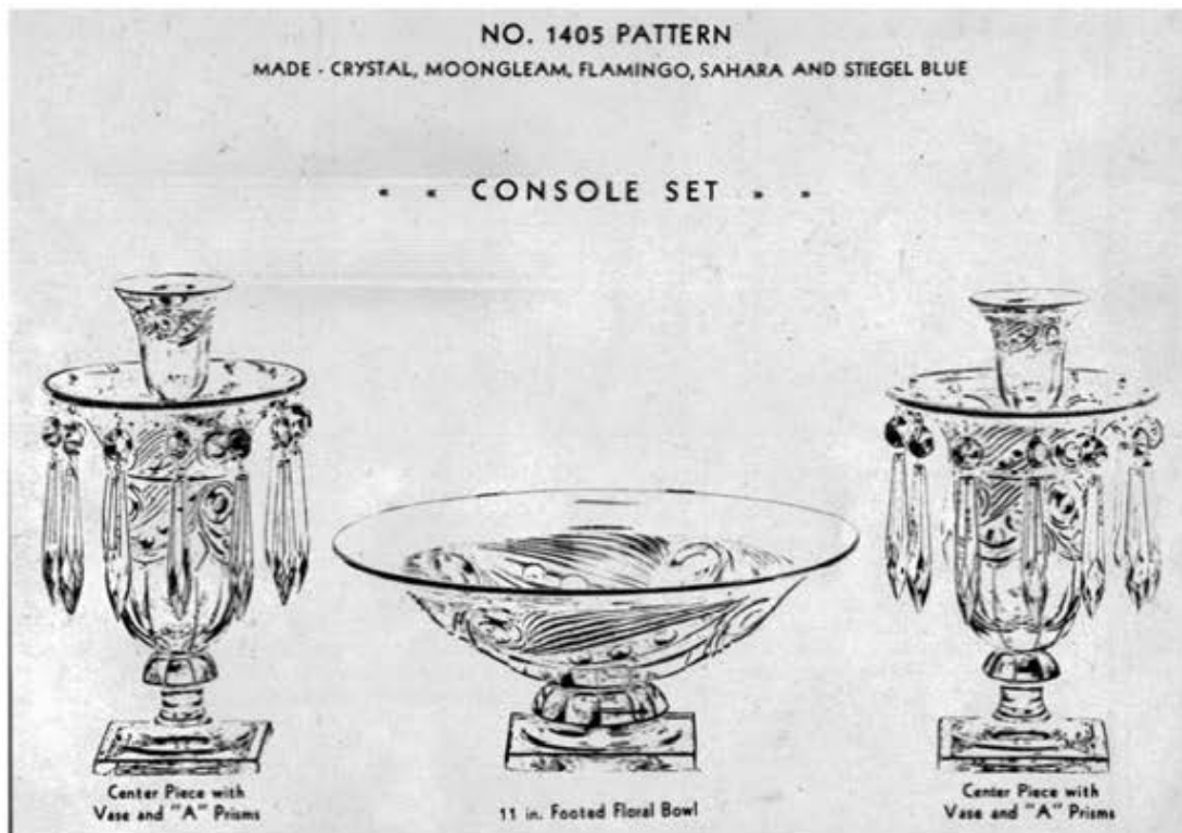
1405 IPSWICH – Cat. 109 Addendum – P181

early 1950s, Ipswich was revived for a very short period.