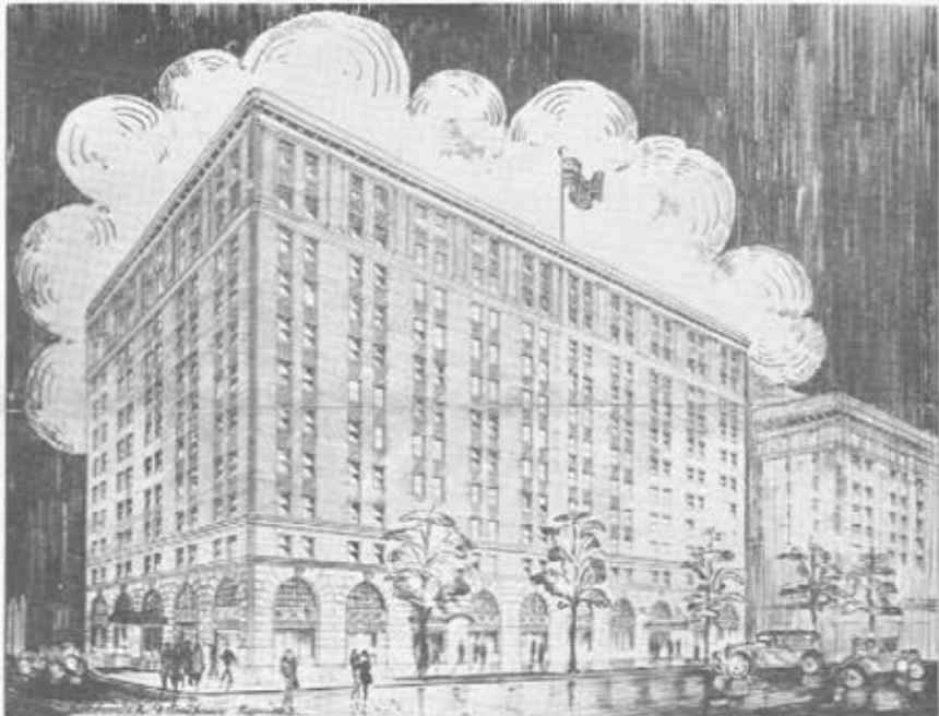
Hotel Van Cleve, Dayton, Ohio, Is a Handsome Structure