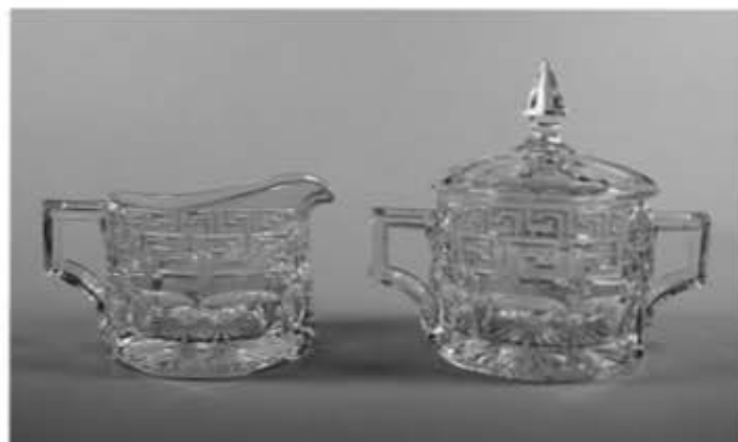
Figure 2 – Round Hotel

friends, and "Grecian Border" when you want to impress, and you'll do just fine.