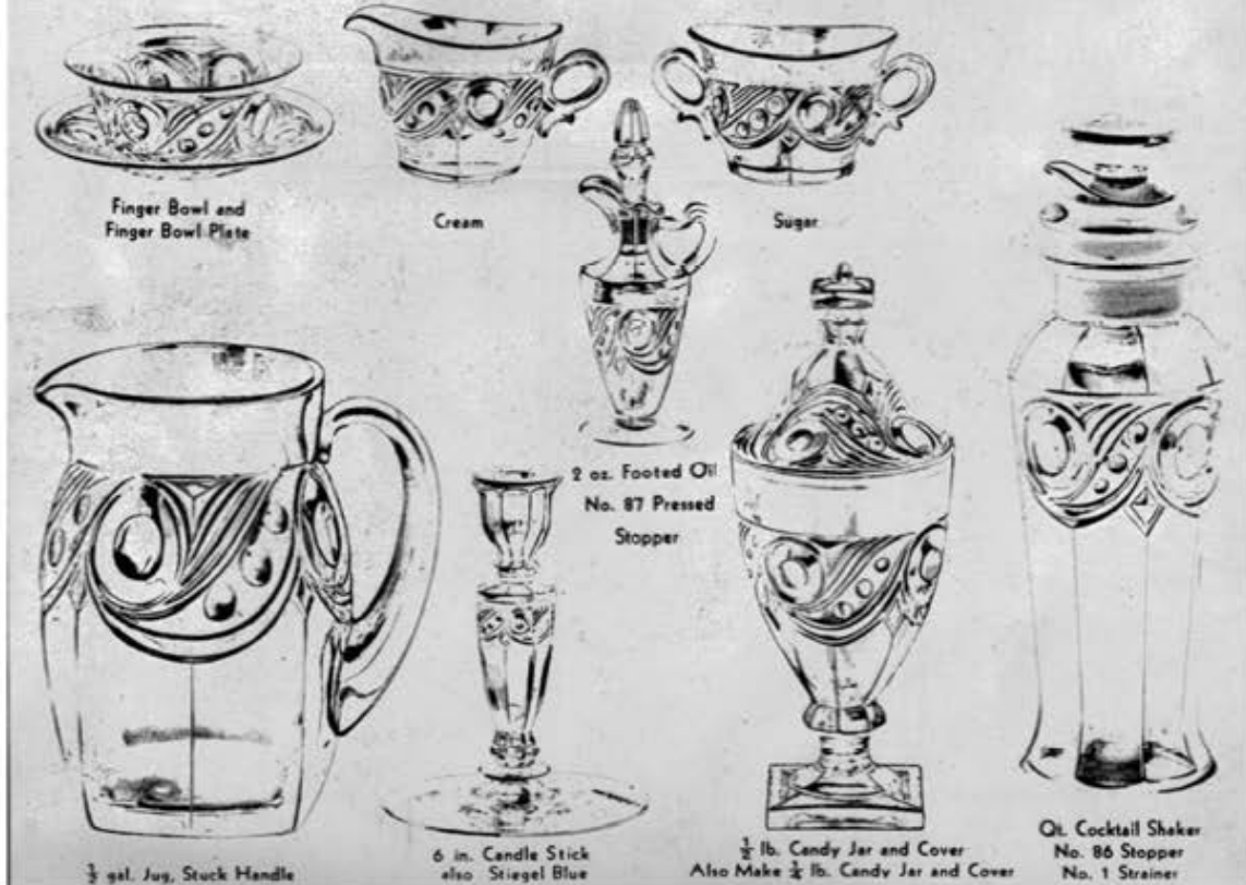
1405 IPSWICH – Cat. 109 Addendum – P 180