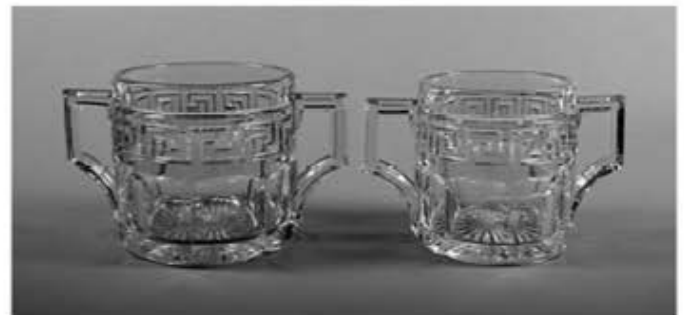
Figure 4 – Table Sugar and Spoon

sometimes said they are the same. However, a close look at the catalog illustrations and actual pieces shows there is a difference. Most of the time, sizes were accurately shown in Catalog 75, the one in which the 433 pattern first makes its appearance. (If you don't have a reprint of Catalog 75 handy, you can also look in Vogel, Vol. 2, for the same illustrations.) Carefully measure the illustrations for the table sugar and the spoon, and you'll find that the sugar is drawn wider than the spoon. Actual examples bear this out. While they are the same height (allowing for how vigorously the bottom may have been ground on individual pieces), the sugar is a full half-inch wider. That's enough to have required two different molds. When looking at the sugar with its cover on, the difference is less obvious, so I've included an illustration with the sugar, cover removed, and the spoon beside it for comparison (Fig. 4). The sugar cover cannot fit on the spoon. How do you tell out in the field? The sugar is a little wider than it is tall, and the spoon is a little narrower than it is tall. Just remember—sugar makes you fat! This is just like you see in other patterns. The spoon needs to be narrower to hold the spoons within it upright, and the sugar needs to be wider to make it easier to scoop or pick out the sugar inside.