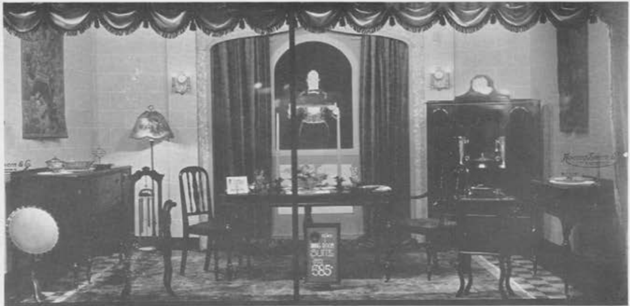
Hoenig, Swern & Co., Trenton, N. J., Display Heisey's Glassware and Furniture

IN displaying glassware it is a good idea to show how it may be used in the home. In the minds of customers actual suggestions of this nature form vivid pictures, which are most forceful in leading them to think how they could use glassware in a similar manner. When they begin to think in this way, they are selling themselves, and that is the next step to making a purchase.