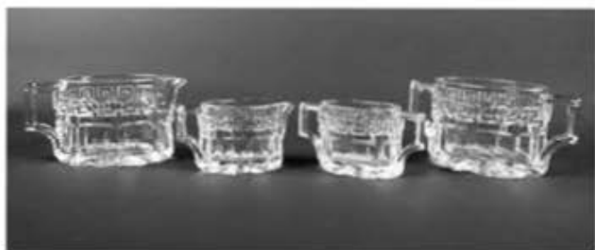
Figure 1 – Oval Sets

Heisey dabbled with many influences, but they certainly knew Greek. A favorite with many collectors, 433 Greek Key was popular when it was being produced, too. I suppose we each have our reasons for liking it. For me it was the weight of the pattern and the depth of the design. Greek Key was introduced about 1911 or 1912, with a full line right off the bat. In just a few years, though, many pieces were dropped, and the last Greek Key was made about 1938. None of the creams and sugars were made in anything but crystal, having been dropped before the resumption of color in the 1920's.