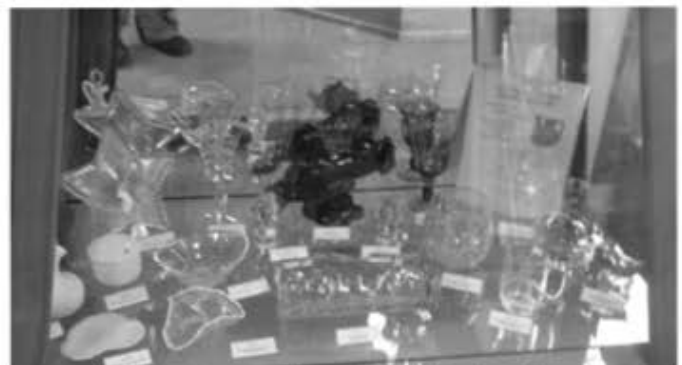
Select Items from Benefit Auction

If you have questions or concerns or want to help, please contact me at masdgs@aol.com or give me a call at 937-372-7166. I'll see you at the auction! ♦