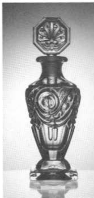
1405 IPSWICH COLOGNE

The candy jars are also very nice and now quite difficult to find. The larger ½ pound one used the candlevase mold to form the base of the candy jar, while the smaller ¼ pound one used the goblet as the base. The lids are of different