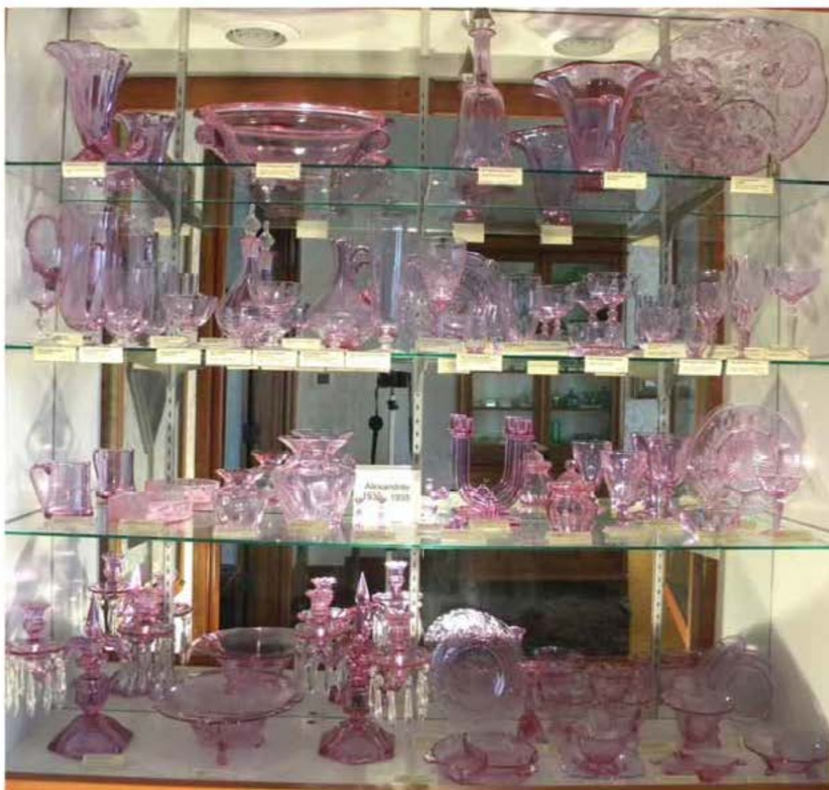
Alexandrite Display in North Front Parlor – King House