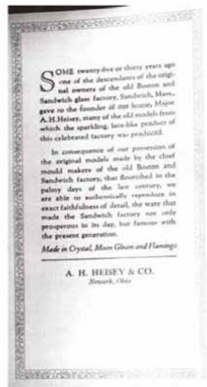
Sandwich Brochure - Back

These pieces make an interesting area for collecting of Heisey. We talk today of reproduction Heisey. Well, these pieces truly were Heisey produced reproductions. The 5" 1238 Beehive plate makes a good piece to collect in many different Heisey colors. ♦