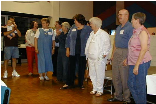
People attending their first Convention were welcomed!