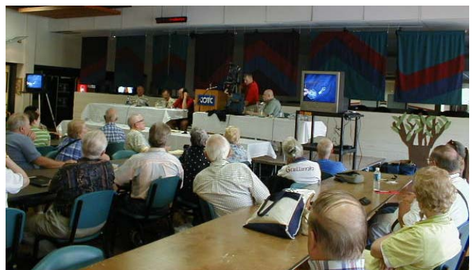
The ID Session continued its popularity

Plan to join us next year at the Former Employees' Reunion. ♥