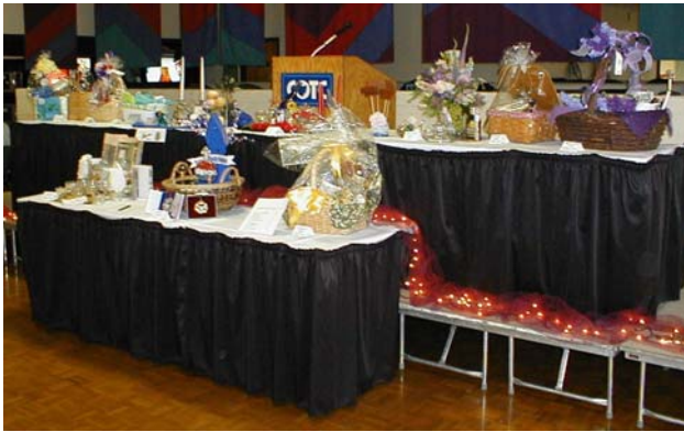
Some of the centerpieces that were up for auction