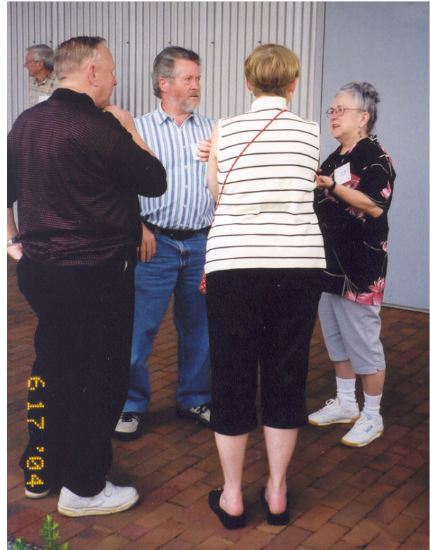
Attendees gather outside of The Works before the Cookout