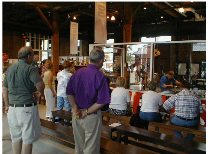
Attendees always enjoy the glassblowing demonstrations at The Works.