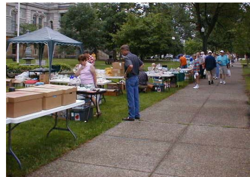
Back by popular demand the Saturday Morning Flea Market nearly encircled the Court House Square