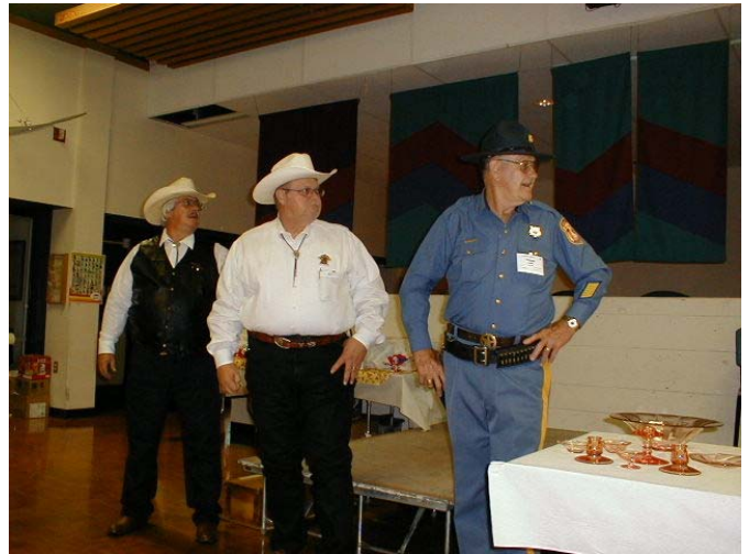
Move over “Montes” it’s the Heisey Lawmen