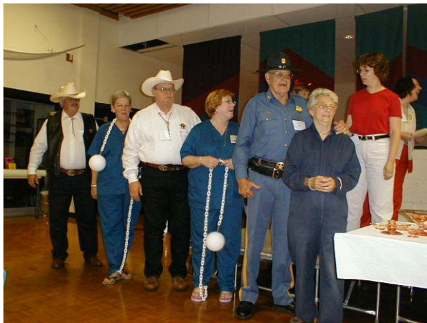
The couples category