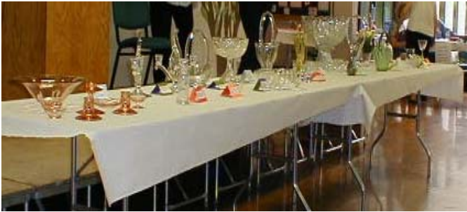
Some of the beautiful pieces donated for the Blind Auction

Every successful event is backed by a group of high energy and committed individuals. The song that goes, "I love those dear hearts and gentlepeople," is representative of the volunteers that truly made the Blind Auction a fun and profitable evening.