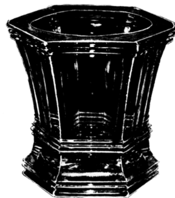
Number 379 Urn

The decanter stands 8" tall with the top and 6 1/4" without. The stopper is a single piece. The example in the Museum has the stopper stuck into it and it could not be dislodged. The bottom of the stopper has a 1 1/4" recessed section to allow for pouring when positioned beside the pour spout incorporated into the bottom. Turning the stopper away from the pour spout would make a seal allowing the shaker to be shaken mixing the ingredients of the cocktail. The