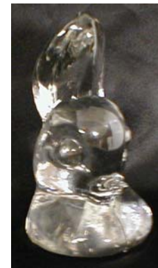
Doe Head in crystal

Price _____ x $65.00 @ = _____ OH Tax ID#: _____ Tax (OH Only): _____ x $4.55 @ = _____ Shipping & Handling _____ x $7.00 @ = _____ TOTAL - _____