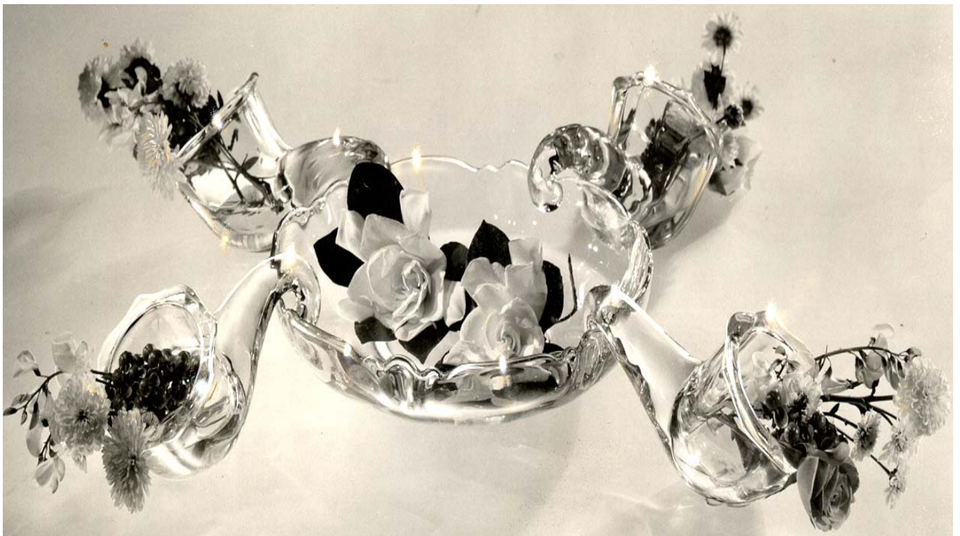
A 1509 Queen Anne Gardenia Bowl surrounded by 4-1519 Waverly Horn Vases