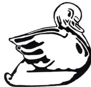
Cygnet from the Activity Book 1

I just had to add this about our latest find. We were at a depression glass show looking around and saw what we thought was a puff box with a lid. We looked at it to check the price because we have one. Upon reading the tag it said it was a soap dish. Well, that got our attention. Looking inside, we wanted to see what made it a soap dish and found the ridges in the bottom to drain the water from the soap. That sold us, we could not leave without it and the price was right. When we got home we looked it up in the books, it is a medium flat panel number 353. The books say Heisey only made this one soap dish. We have collected for over thirty years and had never seen one, we feel blessed to have this one. ♥