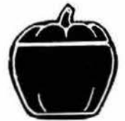
Above: the Toujours Apple Marmalade. Below: the Tom and Jerry Mug.

Please note—The Tom and Jerry Mug (both colors) will be the souvenir for the HCA Holiday Dinner in California. In order to receive the specially etched version, you must attend the dinner. Regular orders from the Museum Shop will not be etched. In the event there are leftovers from the dinner, they will be sold in the shop, but not until the middle of December. ♦