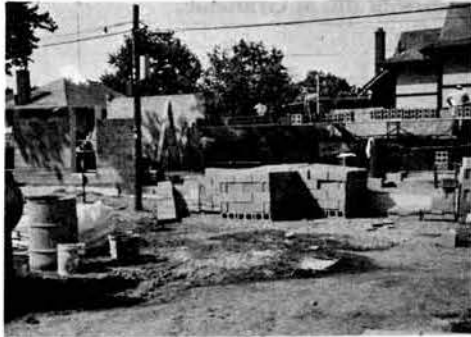
Work begins on the second story.

The fall days here in central Ohio have been warm and sunny and the nights cool, clear and crisp. The trees are getting more colorful every day. This beautiful fall weather has enabled our construction workers to make good progress on the museum addition. The concrete for the second floor has been poured and as I write this, the second story cement block walls are being built.