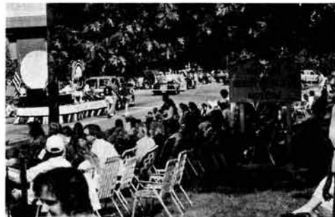
Spectators gathered on the Heisey Museum lawn to watch the annual United Way Parade which traveled along Church St towards downtown.

Proceeds from this mini auction will be split--half to the Building Fund and half to the Endowment Fund.