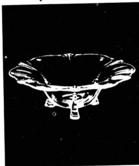
No. 1509—11 in. Ftd. Floral Bowl