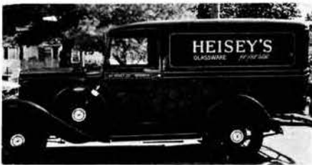
Ca. 1930 Chevrolet panel truck made an appearance in the 1992 Flint Festival Parade. Though not an original Heisey Co. truck, it was restored about 15 yrs. ago by a local Newark man who copied the Heisey advertising from a photograph he had seen.

The daily operation of the club has kept the focus on meeting operational expenses. When the Endowment Fund was formed, there was no formal push to increase it until 1988 when plans were made to focus attention to the fund and make it grow more rapidly. The people of Heisey collecting have been very resourceful in a short time to have done all of the things they have done financially, along with making it the most secure and safe collectible when they purchased the original existing molds, bought a warehouse for these molds and continued to grow in other ways. It is hoped each of you will consider how you can join in with your help to make this fund grow rapidly. All gifts are 100% tax deductible. If you need any information or help in making a gift, you are welcome to contact members of the Endowment Fund Committee. Members are: Bob Ryan, Chairman, Amy Jo Jones, Co-Chairman, Curt Guilmette, Charlie LeBlond, Chuck Jones, and Carl Sparacio. Contact HCA for assistance in locating any of the members.