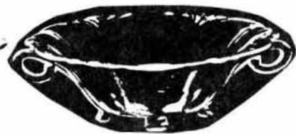
#1509 Queen Ann