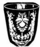
#503 Minuet etch #515 Heisey Rose etch #507 Orchid etch