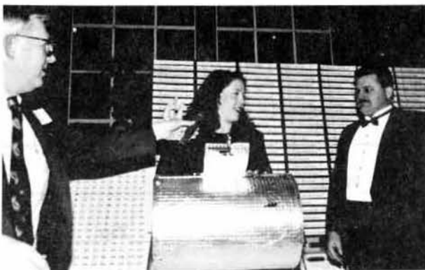
The first number was drawn

Throughout the evening, numbers were drawn and names called and as we came closer and closer to the last five numbers the Las Vegas part of the evening ended and everybody gathered around to see WHO the lucky winner of the Big Prize would be!