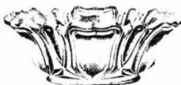
#365 Queen Ann

Our quote for the month: " Bad officials are elected by good citizens who do not vote. "