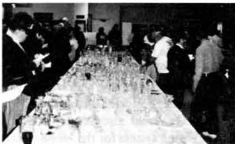
Heisey galore at the March Benefit Auction.