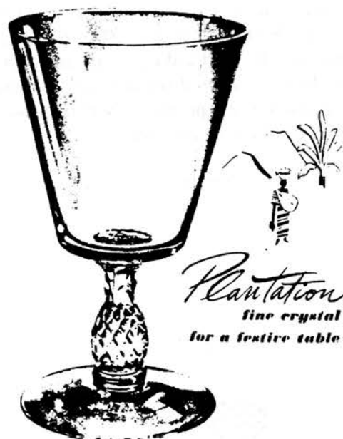
Figure 3 PLANTATION