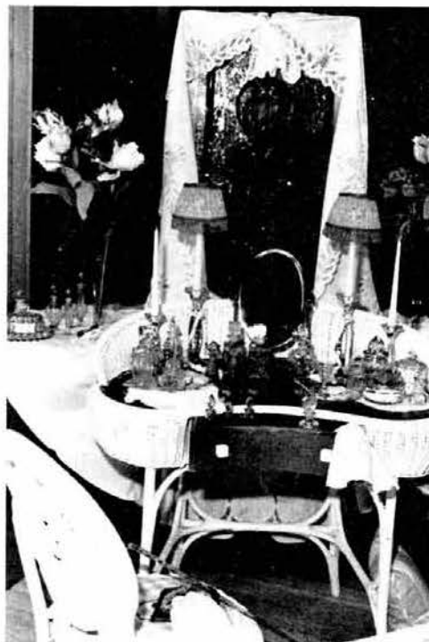
1990 Display photo.