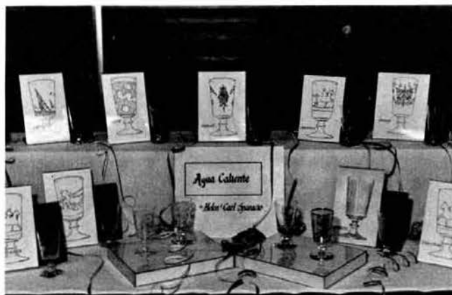
1990 Display, photo., by K. Johnson Bowles