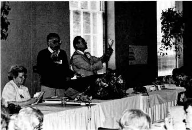
1990 Annual Meeting photo., R. Lawrence