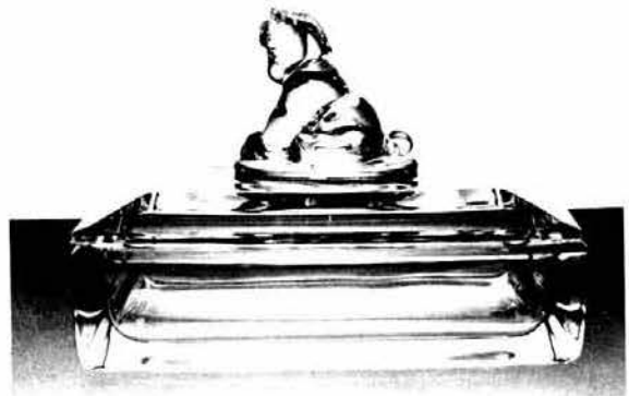
SITTING PONY CIGARETTE BOX 6¼" long 4½" high