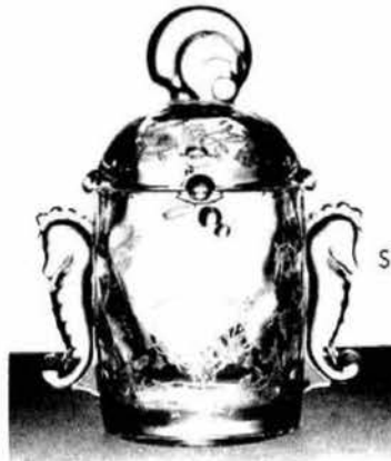
SEA HORSE HANDLED CIGARETTE 5½" high