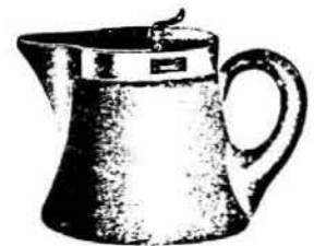
No. 363-5-oz. PATENT No. 52675