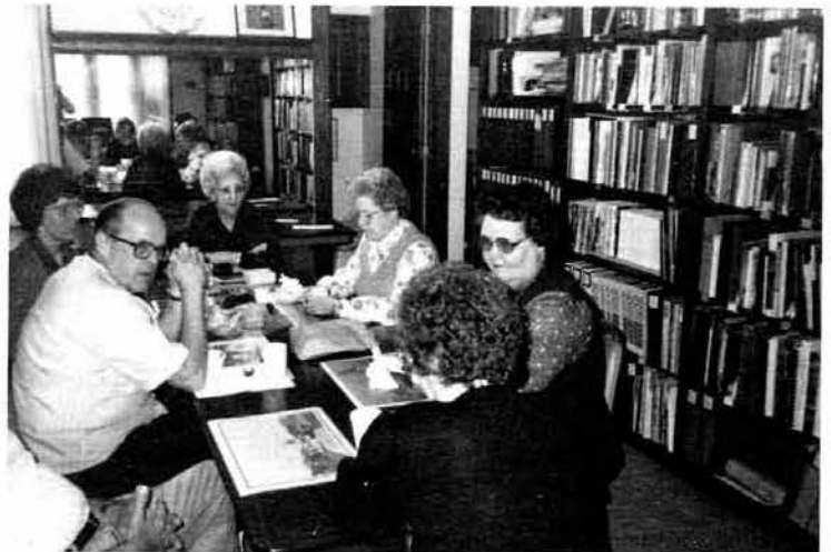
THE "LUNCH BUNCH" IN THE LIBRARY OF THE MUSEUM. MONDAY AFTER THE AUCTION. EMPLOYEES.