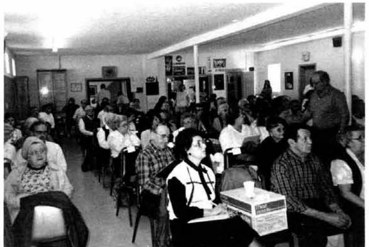
PART OF THE CROWD