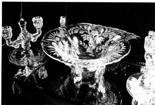
134 Trident Candleholders 1401 Empress Floral Bowl Copy of Original Heisey Picture

From "American Flint Magazine" the glass union magazine for January 1967.