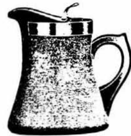
No. 371-7-oz. PATENT No. 60378

The *'s on this list indicate damage not noted in the auction list or some other discrepancy in description. In some cases the mail bidder was on the "wrong end" and another bid would make him go over your bid.