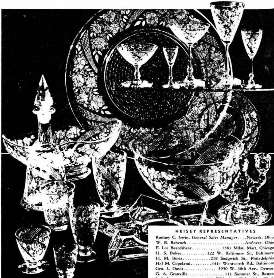
Among the many beautiful pieces shown above, all with the "NORMANDIE" (No. 480) Etching, are; Nos. 3389 Sherbet, Wine, Champagne, Cordial, Goblet, Oyster Cocktail and Cocktail; 1476 Torque Plate, 1429 Floral Bowl, 4035 Decanter, 4056 Salad Bowl, 1184 Plate, 5 and 12 ounce sodas, 2401 Old Fashioned, 1466 Relish and 134 Candle Stick. At the New York Show, Heisey will exhibit in Rooms 654 and 656, Pennsylvania Hotel. At the Chicago Show, 1560-61 Merchandise Mart.