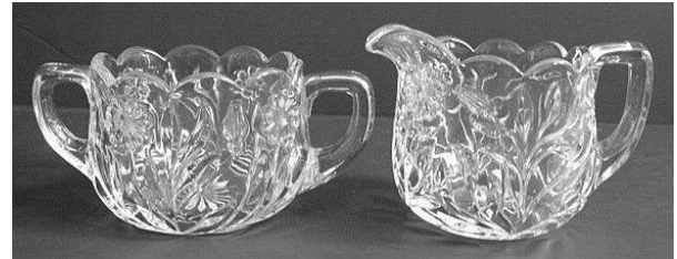
Fig. 6: No. 427 Daisy and Leaves cream and sugar