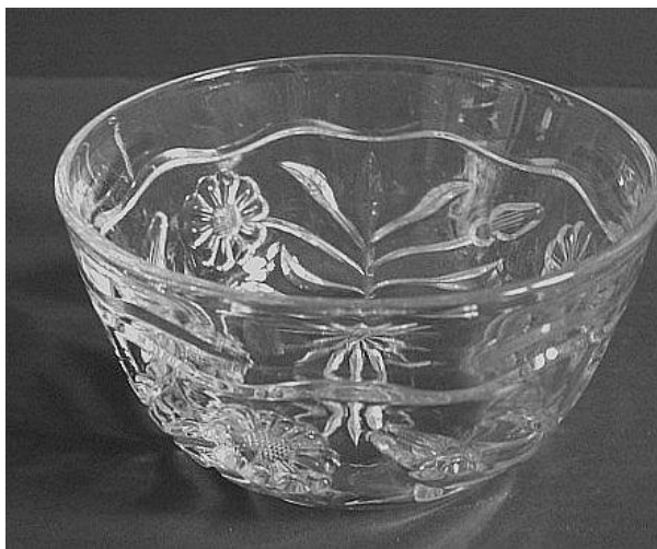
Fig. 4: No. 427 Daisy and Leaves finger bowl