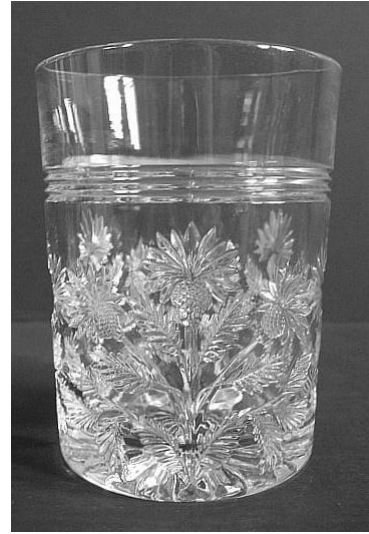
Fig. 16: No. 182 Thistle tumbler

Two remarkably similar, and confusing, items appear in Figure 17. The plate on the left is No. 7099 Three Scroll. It is six-sided and has three repeats of the floral design. The plate on the right is No. 8007 Daisy Scroll. It is eight-sided and has four repeats of the design. Plates and nappies were made in both patterns. The original Heisey numbers for these items have not yet been discovered.