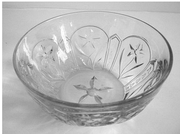
Fig. 13: No. 480 Daisy and Leaves 5 1/2" nappy (previously known as No. 7011 Daffodil)

Because the No. 435 Juniper tumbler (Fig. 14) appeared in one Heisey catalog (circa 1910), its original Heisey pattern number is known (it was named by HCA). There may be two versions of this tumbler. In the catalog drawing, there are fronds on the berries that do not appear on the tumbler in the photo (Fig. 15). It is also possible the drawing is not accurate.