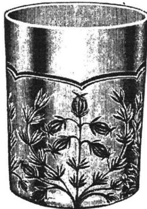
#435 - Tumbler Ground Bottom