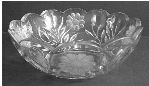
Fig. 5: No. 427 Daisy and Leaves 8" nappy, satin finish on flowers and buds