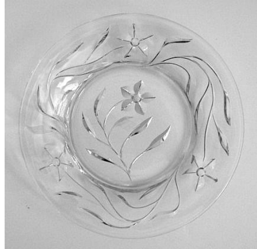
Fig. 12: No. 480 Daisy and Leaves 8" plate (previously known as No. 7098 Cut Daisy)