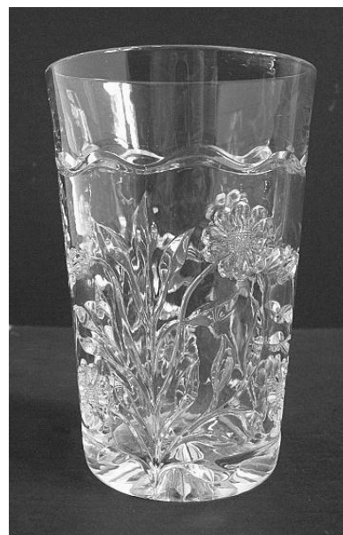
Fig. 7: No. 427 Daisy and Leaves iced tea tumbler