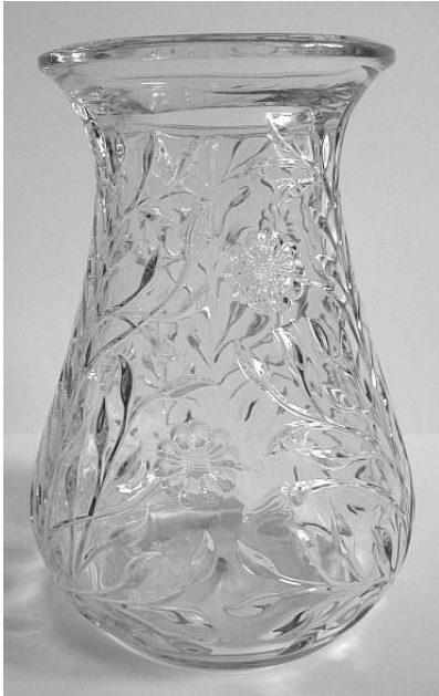
Fig. 8: No. 427 Daisy and Leaves 9" vase