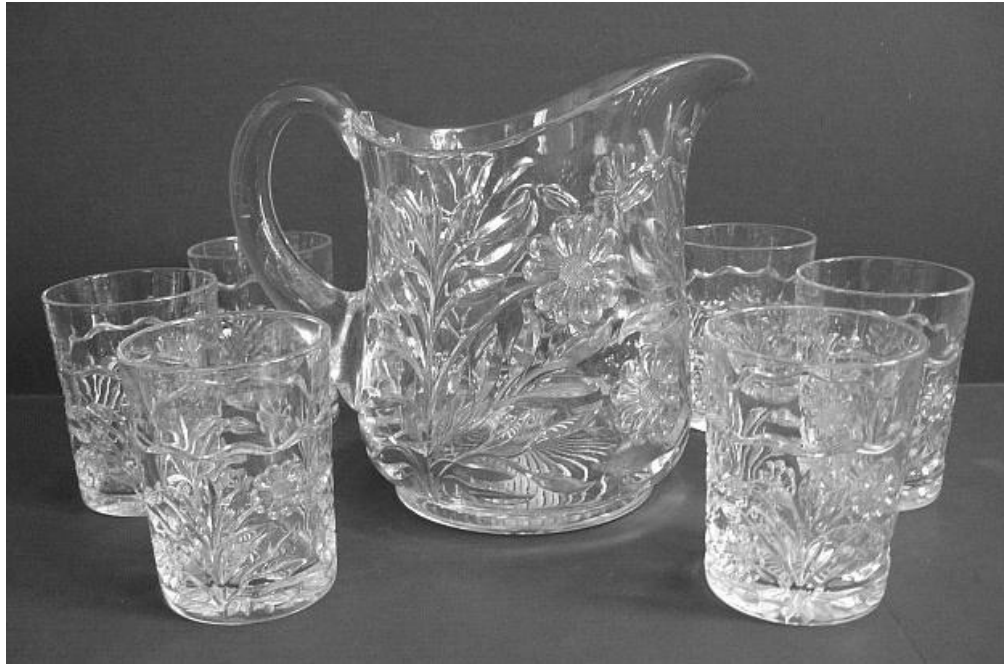
Fig. 1: No. 427 Daisy and Leaves half gallon jug and tumblers

Many glass companies, both before and after A. H. Heisey & Company, turned to the natural world for inspiration for their designs. In the late 19th and early 20th centuries, makers of pressed glass often used floral and other botanical motifs in their patterns. Heisey's early patterns did not include these types of elements, but in around 1910, Heisey introduced several pressed designs that featured botanical motifs. Some of them were not in production for a long enough time to appear in one of the company's catalogs, but some of their original Heisey pattern numbers have been discovered recently. The items whose original numbers are not known are identified by the pattern numbers and names assigned to them by HCA or Heisey researcher Clarence Vogel. However, they can be definitely identified as Heisey products, because they are marked with the Diamond H. All are known in Crystal only. This article will focus on these pressed botanical designs.