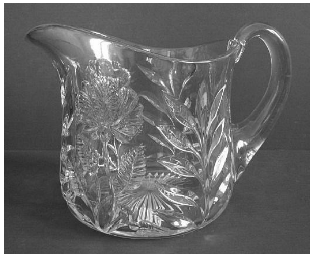
Fig. 10: No. 427½ Oriental Poppy half gallon jug (previously known as No. 8019 Oriental Poppy and No. 7061 Iris or Leaf and Iris)

One of the two half gallon jugs mentioned above was recently identified as the jug shown in Figure 10. Despite featuring a floral motif different from other items in the Daisy and Leaves line, it was assigned the number 427½. HCA previously gave it the number 8019 and named it "Oriental Poppy," a more accurate description of the flower that appears in the pattern. Researcher Clarence Vogel gave it the number 7061 and named it "Iris" or "Leaf and Iris."