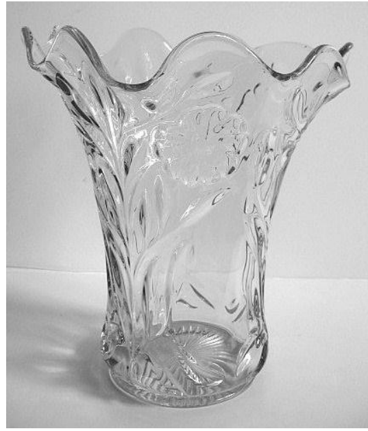
Fig. 9: No. 51-440 Daisy and Leaves 10½" swung vase

One of the two half gallon jugs mentioned above was recently identified as the jug shown in Figure 10. Despite featuring a floral motif different from other items in the Daisy and Leaves line, it was assigned the number 427½. HCA previously gave it the number 8019 and named it "Oriental Poppy," a more accurate description of the flower that appears in the pattern. Researcher Clarence Vogel gave it the number 7061 and named it "Iris" or "Leaf and Iris."