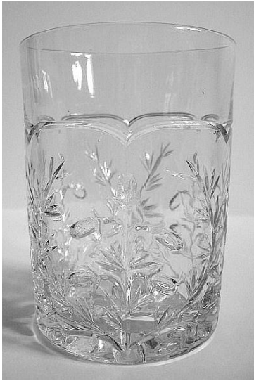
Fig. 14: No. 435 Juniper tumbler