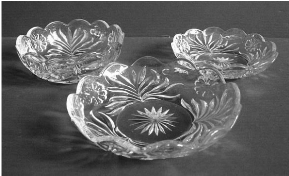
Fig. 3: No. 427 Daisy and Leaves small nappies: 4½", 4¾" shallow, 5½" shallow