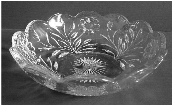
Fig. 2: No. 427 Daisy and Leaves 9½" shallow nappy

a hotel cream and sugar, a 9" vase, and swung vases in sizes from 7½" to 48" (Fig. 1-9). The swung vases are numbered from 50-440 to 59-440, based on their height.