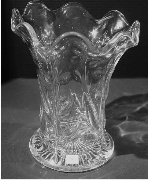
Fig. 18: No. 453 Pussy Willow vase

Researchers have suggested that the Daisy and Leaves pattern, and similar pressed floral designs, were intended to imitate the floral cuttings and engravings of the period and compete with McKee's Rock Crystal and Puritan lines, and the pressed floral and botanical designs offered by Cambridge (in its Nearcut line) and Fostoria. The short production period of Daisy and Leaves and the scarcity of items with similar pressed designs indicate Heisey's effort to compete with other glass companies' pressed botanical designs was not particularly successful.