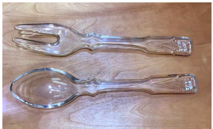
No. 2 Kathy salad fork and spoon, beaded, a new museum purchase