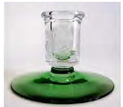
No. 116 Charter Oak candlestick, Crystal and Moongleam

Heisey's 4262 Charter Oak 10" water lamp (1928-1931), was made from the comport mould of its No. 3362 Charter Oak (1926-1935) pattern line. The moulded stem has the typical Heisey "acorn" of that pattern, which is also the reverse of what one might find in nature, as the cap/cupula is smooth, while the seed has a beautifully diamond-moulded outer layer instead of being smooth as in nature. The base was also moulded, while the diamond optic bowl was blown. It is most likely hallmarked at the top of the stem. It is found in Crystal, Flamingo, and Moongleam. A 1929 company catalog listed Moongleam 4262 water lamps at $26 per dozen! "Back in the day" it was valued at more than $300 each, including one Flamingo example auctioned off at $675 in 1991. Rarity must be enhanced by the fact that few may have survived because it was most likely top heavy with all the electrical adaptations on top. (Facts and values drawn from the research of Tom Felt and Bob O'Grady.)