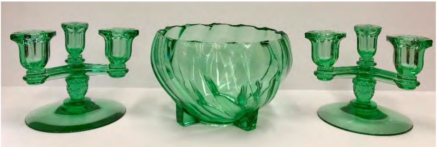
Advertised as a complement to Heisey's No. 1252 Twist pattern, the Tricorn candlesticks are stunning with the Nasturtium bowl