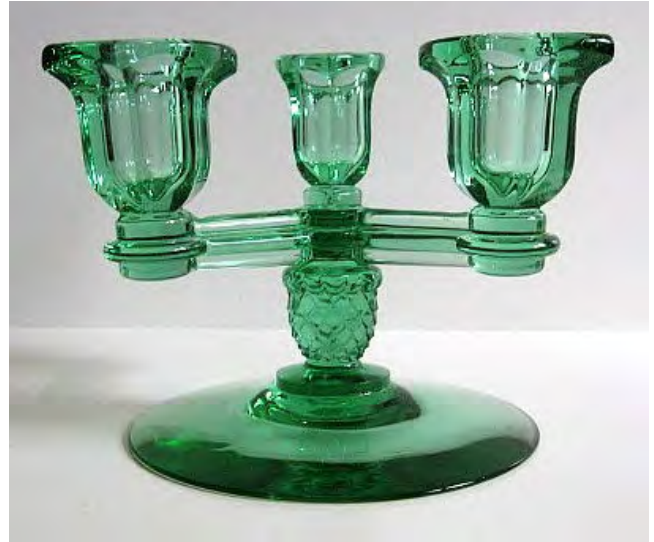
No. 129 Tricorn candlestick in Moongleam

Heisey's No. 129 Tricorn 5" Triplex (1929-1936), named by researchers, has the unusual form of three ridged, equidistant arms set upon an acorn column. The molded acorn column is the reverse of what one might find in nature, as the scalloped cap/cupula is smooth, while the seed has a beautifully diamond-moulded outer layer instead of being smooth as in nature. The three candle cups have six panels and a marquise diamond-shape (oval with pointed ends). The base, which was moulded separately, has a 1½ inch small platform top, and flares to about 5½ inches. It is usually hallmarked above the acorn between two of the arms. Advertised as a complement to Heisey's No. 1252 Twist pattern, it is stunning with the Nasturtium bowl as a console set! Felt and the Stoers value it at $60-75 in Crystal, $110-130 in Flamingo, $150-175 in Moongleam, $90-110 in Crystal with Moongleam base, and unable to price in Marigold. (Facts and values drawn from the research of Tom Felt, Bob O'Grady, and Elaine and Rich Stoer.)