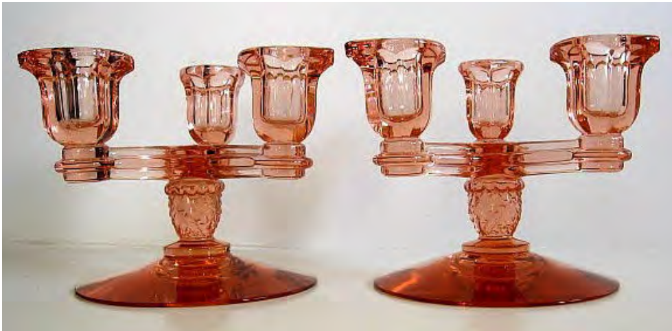
No. 129 Tricorn candlesticks, Flamingo Right: No. 4262 Charter Oak water lamp