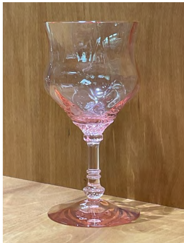
No. 7005 Double Ring goblet, Flamingo

No. 5079 Pan American goblet with 518 Pan American Lei etch