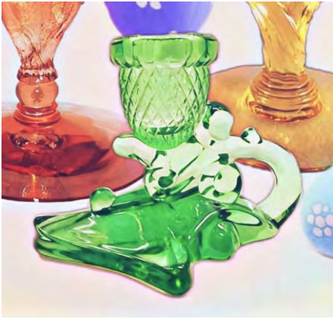
No. 130 Acorn candlestick, Moongleam