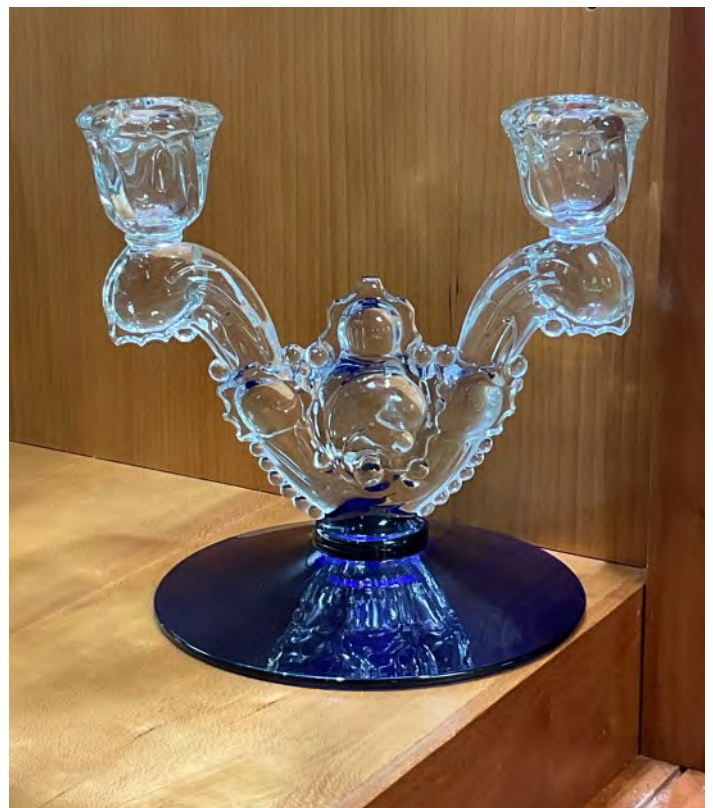
No. 1519 Waverly candlestick, 2 light with Cobalt base, pr. in memory of Kathy Files