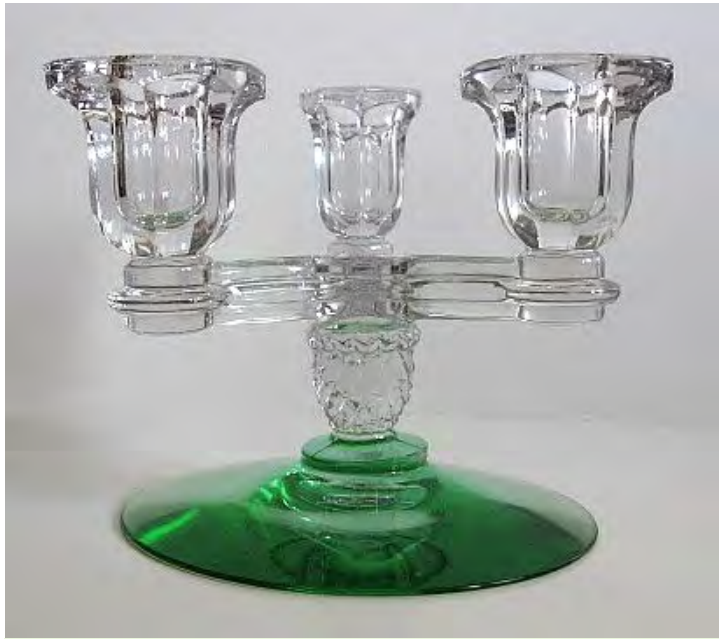
No. 129 Tricorn candlestick, Crystal and Moongleam