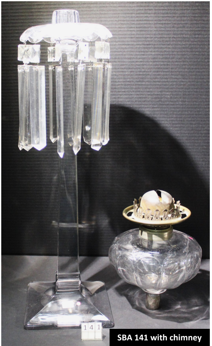
SBA 141 with chimney