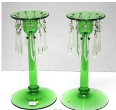
SBA DAY #2 - LOT 134