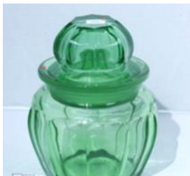
SBA DAY #2 - LOT 117