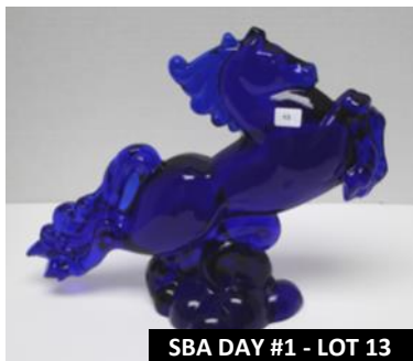
SBA DAY #1 - LOT 13