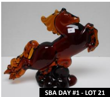
SBA DAY #1 - LOT 21