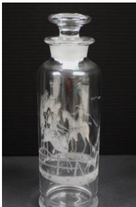
SBA DAY #3 - LOT 618