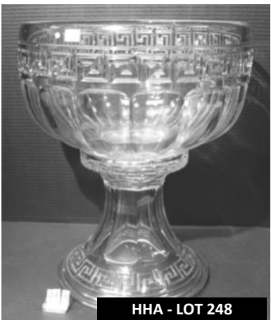
HHA - LOT 248