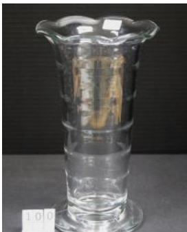
SBA DAY #2 - LOT 100