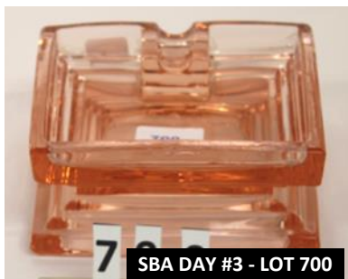
SBA DAY #3 - LOT 700