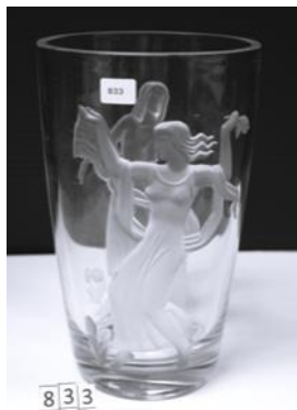
SBA DAY #3 - LOT 833

243, 671-687), 1401 Empress in Sahara (226-237, 266-274, 288-298) many with 448 Old Colony etch, and 1567 Plantation (41-48, 275-283, and 639-642). Lots 69 - 78 offer many unusual pieces with 458 Olympiad etch.