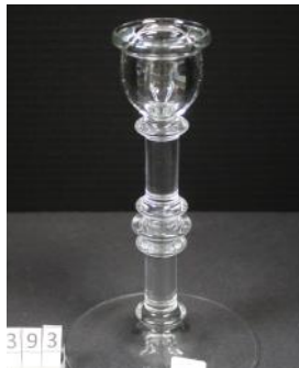
SBA DAY #2 - LOT 393