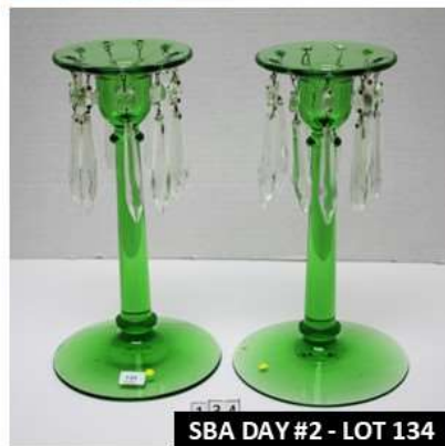
SBA DAY #2 - LOT 134