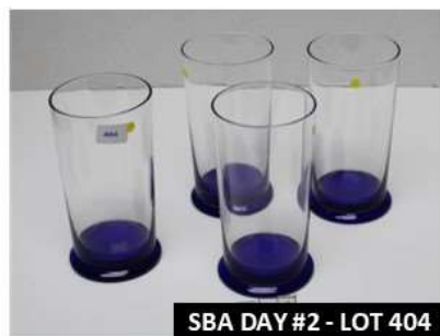
SBA DAY #2 - LOT 404