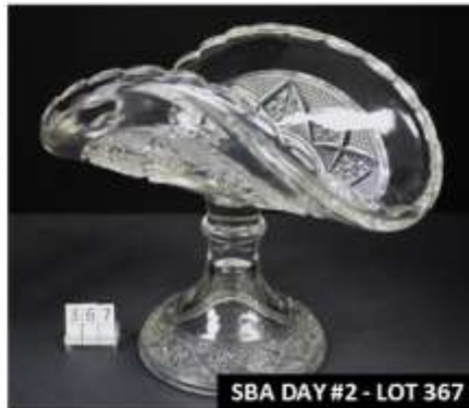
SBA DAY #2 - LOT 367