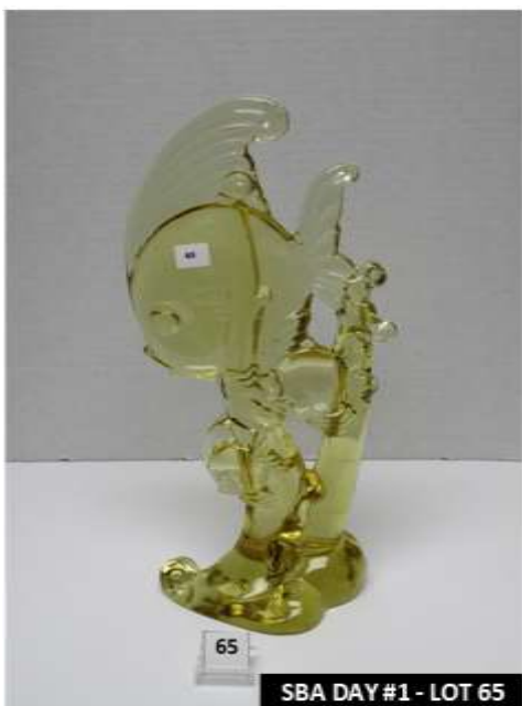
SBA DAY #1 - LOT 65

Periodical Postage Paid at the Post Office In Newark, OH 43055 Publication # 00986 POSTMASTER SEND FORM 3579 TO: HCA 169 W. Church St. Newark, OH 43055