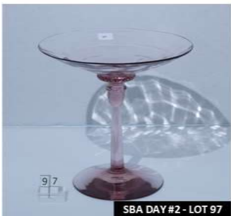
SBA DAY #2 - LOT 97