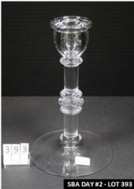
SBA DAY #2 - LOT 393