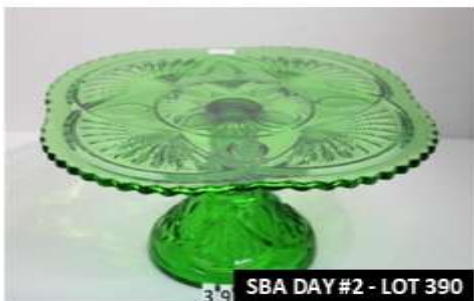
SBA DAY #2 - LOT 390