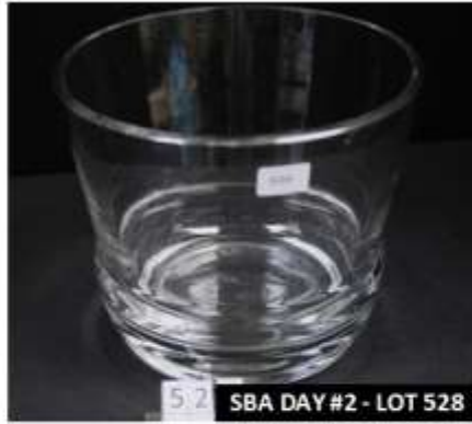
SBA DAY #2 - LOT 528