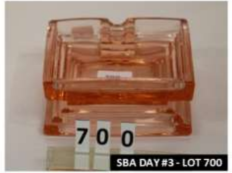
SBA DAY #3 - LOT 700