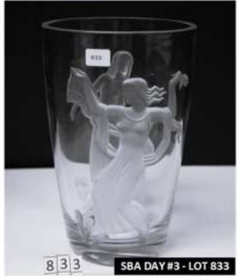
SBA DAY #3 - LOT 833