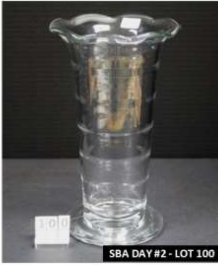
SBA DAY #2 - LOT 100