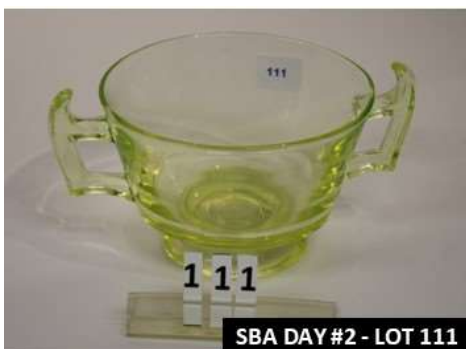
SBA DAY #2 - LOT 111