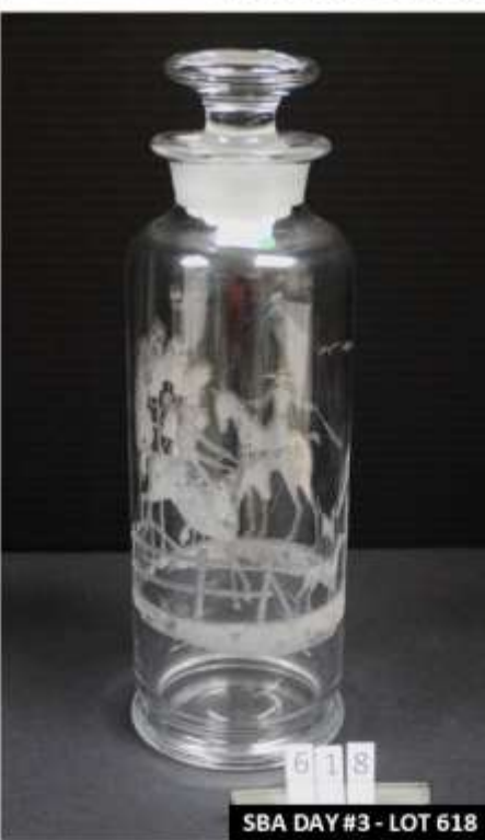
SBA DAY #3 - LOT 618