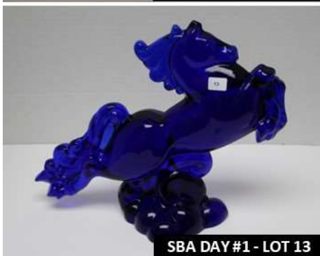
SBA DAY #1 - LOT 13