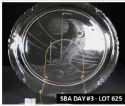
SBA DAY #3 - LOT 625