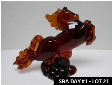
SBA DAY #1 - LOT 21