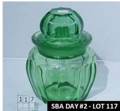
SBA DAY #2 - LOT 117