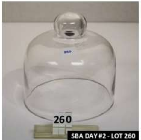
SBA DAY #2 - LOT 260