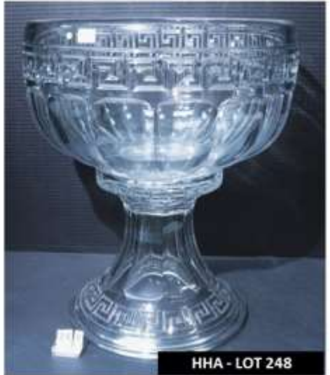
HHA - LOT 248