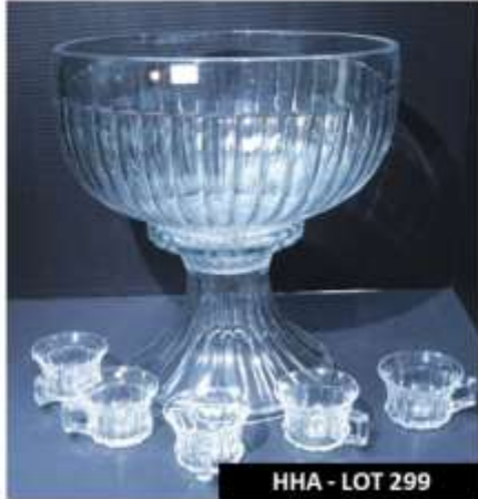
HHA - LOT 299