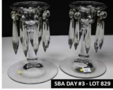
SBA DAY #3 - LOT 829