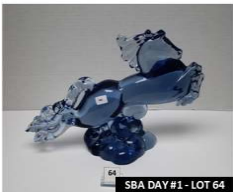
SBA DAY #1 - LOT 64