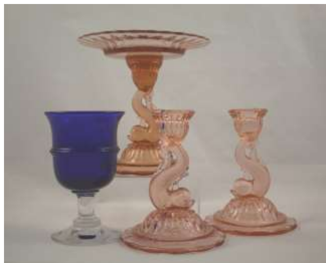
Lot 951A Cobalt Lot 1025A & 1015A Flamingo

Proceeds Benefit The National Heisey Glass Museum