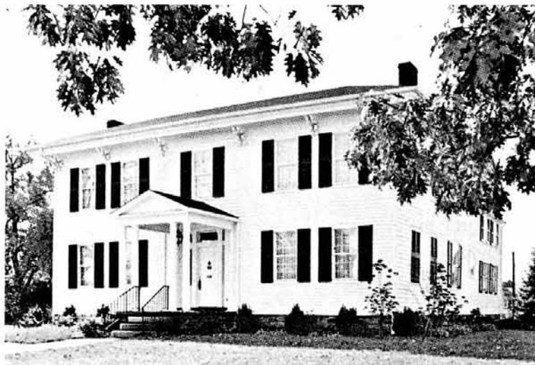
National Heisey Glass Museum

The opinions expressed in articles in HEISEY NEWS are those of the authors and not necessarily those of the organization. The Editorial Staff reserves the right to edit or refuse any material submitted for publication. When requesting information, please enclose a self-addressed stamped envelope (SASE).