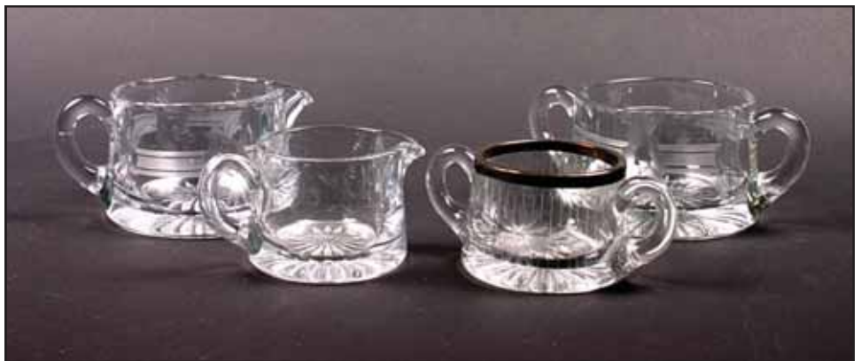
Fig. 3. #1185 Yeoman: hotel set (back) and individual set. The individual sugar has a silver band on the rim.

That leaves the two #1185 Yeoman sets (Fig. 3). These two sets are nearly identical in appearance. The individual set, of course, is smaller, and height is closer to diameter to give a chunky profile; the larger hotel set is a bit squattier. The #1185 individual set is complete just as a sugar and cream; the sugar has no lid. The hotel-sized set is only pictured in catalogs as a plain, uncovered sugar and cream.