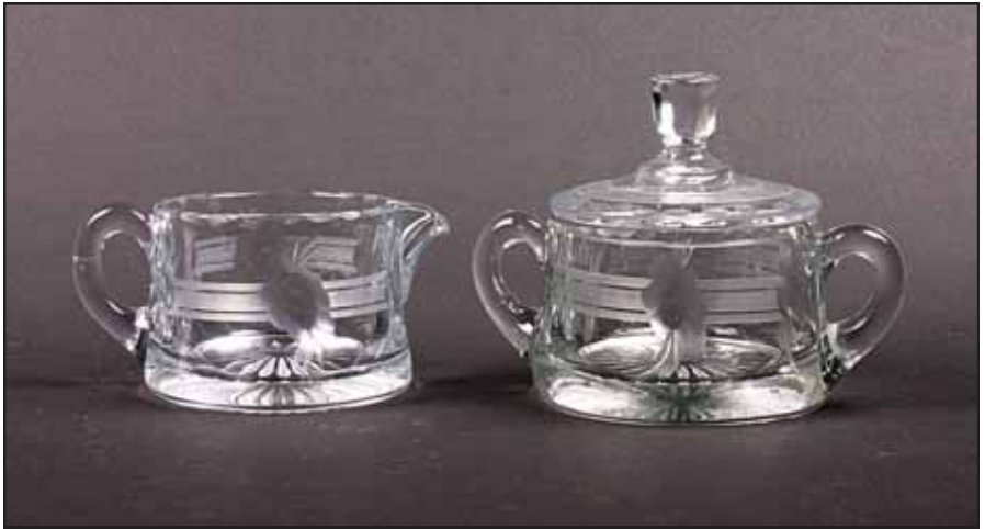
Fig. 4. #1185 Yeoman hotel set, covered, unknown cutting

But the sugar is found with a cover a fair amount of the time (Fig. 4). Price lists show the sugar was sold both ways. The cover is the same design (but different size) as the one used on the #1183½ Revere individual sugar. The bottoms of the #1185 sets, both sizes, tend to be very thick, almost enough you could call them shammed. All the ones I've seen have had star bottoms.