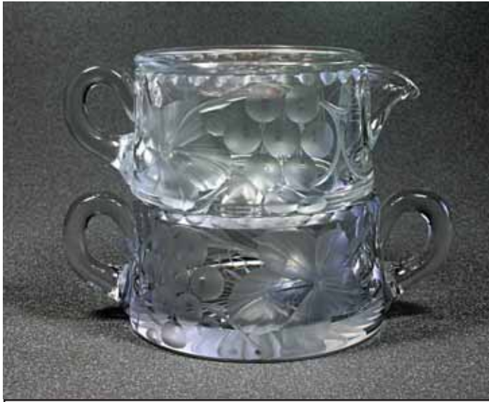
Fig. 2. #1184 Yeoman combination (stack) set, Tuthill (?) Vintage cutting

name? Another long-suffering woman pushed into obscurity.) The #1183 Revere individual sugar is clearly very similar to the #1184 and #1185 Yeoman sugars, but size, if nothing else, separates them. The #1183 sugar is larger than the #1184 or #1185 individuals, but it is smaller than the #1185 hotel. The #1183 sugar's proportions resemble the #1185's more than the much broader #1184. The bottom of the #1183 sugar, at least in all the examples I've seen, is thinner and always plain, never with a star. The #1183 tall individual cream with its hand-pulled spout shares the thin, plain bottom.