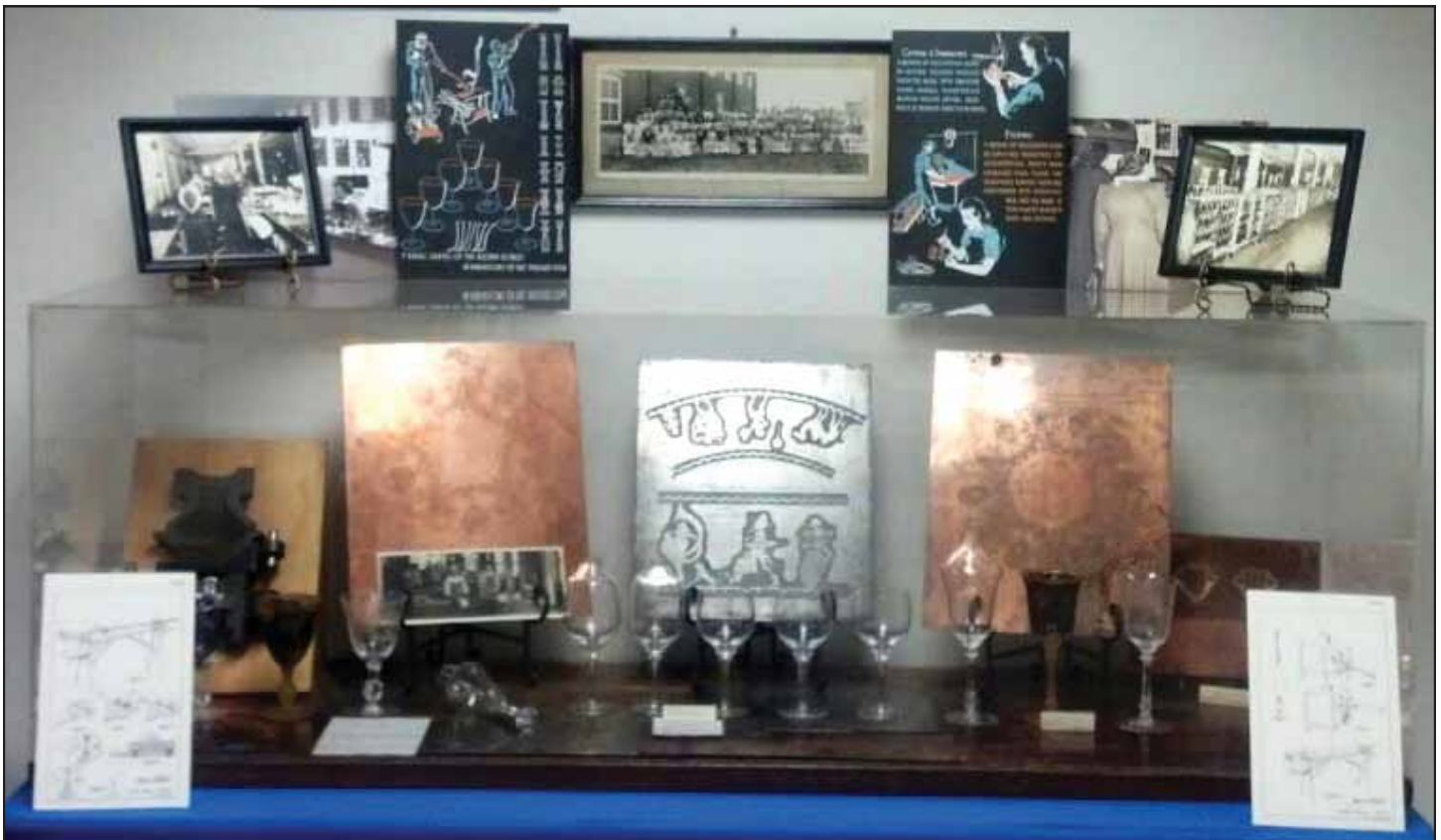
Above: Our factory display in the Lower Level, featuring how a glass stem was hand made at the Heisey Factory. The finishing processes used and the original etching plates are shown with etched pieces. This and many more vignette displays of the Heisey factory are featured in these expanded displays.

Come at your leisure to enjoy more than 6,000 pieces of glassware produced by A.H. Heisey and Company from 1896-1957. Hundreds of patterns are featured in all production colors. Rare and experimental items are included as well. Facilities are air-conditioned and handicapped accessible. The opinions expressed in articles in HEISEY NEWS are those of the authors and not necessarily those of the organization. The Editorial Staff reserves the right to edit, with or without the consent of the author, or to refuse any material submitted for publication.