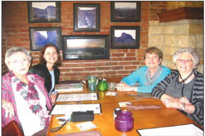
Some members on our Road Trip to Grapevine Convention Center in Texas.