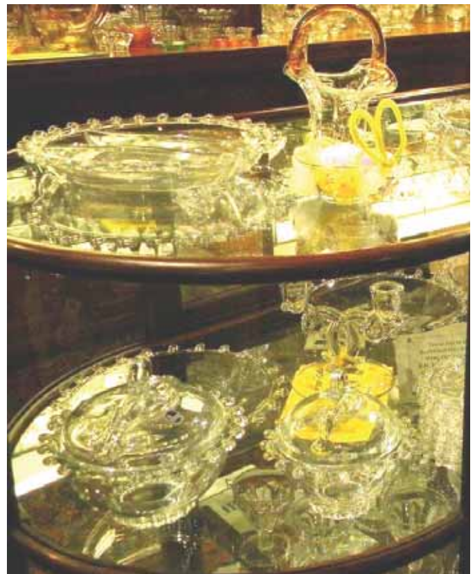
An amazing display of #1540 Lariat for sale in the Gift Shop .