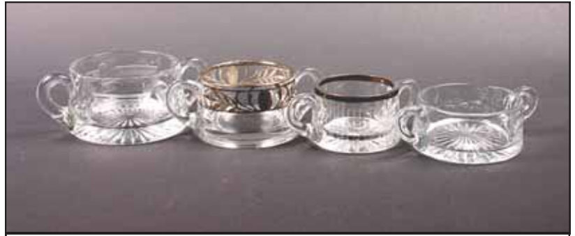
Fig. 5. Low, round, flat, plain sugars: #1185 hotel, #1183 individual, #1185 individual, #1184 individual

We know if that lone cream is tankard style, it can't be #1184 or #1185. It must be somewhere in the range of #1181-#1183. I've already covered the tankard creams in Part One, so let's suppose we're looking at one of the sugars. Most of what I'm going to say applies equally well to a low, round, flat cream.