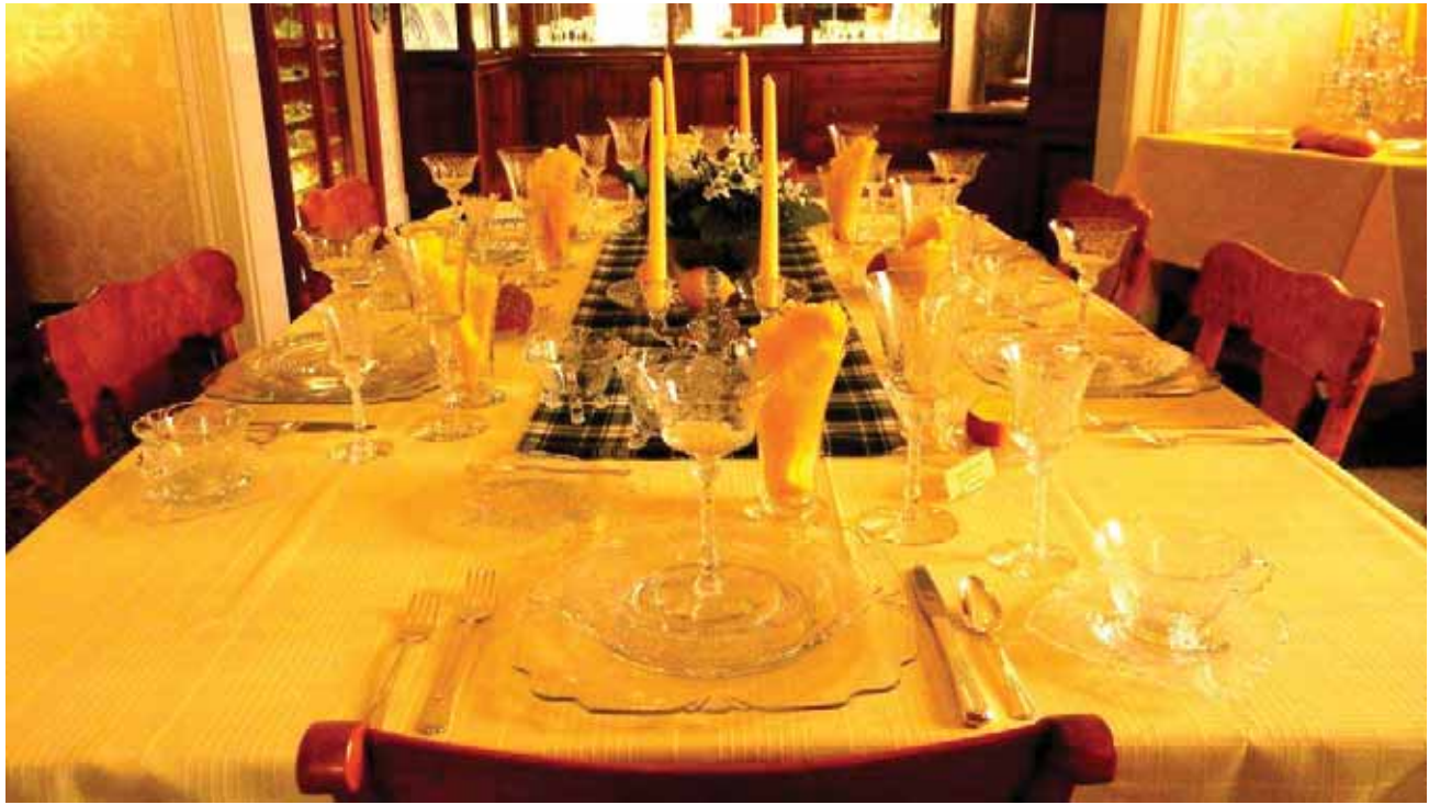
What a beautiful table for Easter dinner or any Spring celebration! Our new #458 Olympiad collection on display in the King House.