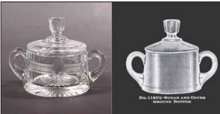
Fig. 6. #1185 Yeoman hotel (L) and #1183 1/2 Revere individual, shown to scale

Suppose the bottom of your plain, round, flat, and forlorn cream or sugar is starred. Then you probably don't have a #1183. If your piece is about twice as wide as it is tall, then it is #1184. If the width and height are closer to each other, say, roughly 1\frac{1}{2} times as wide as tall, then it is #1185. Smaller ones, of course, are individuals and the larger ones are hotels. And then there is that other feature of the #1185's, either the individual or the hotel size; their bottoms tend to be very thick, so thick you might call them shammed bottoms.