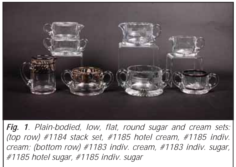
Fig. 1. Plain-bodied, low, flat, round sugar and cream sets: (top row) #1184 stack set, #1185 hotel cream, #1185 indiv. cream; (bottom row) #1183 indiv. cream, #1183 indiv. sugar, #1185 hotel sugar, #1185 indiv. sugar

There are four cream and sugar sets in the Revere-Yeoman continuum sharing these low, round, flat sugars: #1183 Revere individual, #1184 Yeoman individual combination (or stacking), #1185 Yeoman individual, and #1185 Yeoman hotel (Fig. 1). All of them first make their appearances in Cat. 75, about 1913, and all of them continue through to Cat. 100, about 1922. That's the last time we see the #1183 Revere individual sugar and cream, but the other three sets, #1184 and #1185 Yeoman, remained a couple of years longer, last showing up in Cat. 102, about 1924. That means that all of them were discontinued before Heisey started using the Revere and Yeoman names, but that won't stop us from using them.