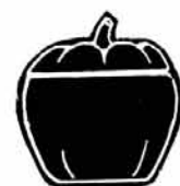
Above: the Toujours Apple Marmalade. Below: the Tom and Jerry Mug.

Please note—The Tom and Jerry Mug (both colors) will be the souvenir for the HCA Holiday Dinner in California. In order to receive the specially etched version, you must attend the dinner. Regular orders from the Museum Shop will not be etched. In the event there are leftovers from the dinner, they will be sold in the shop, but not until the middle of December. ♦