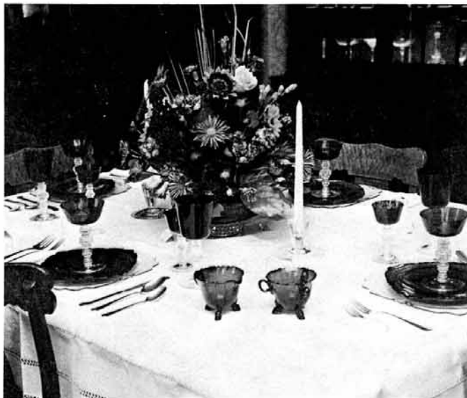
#1401 Empress and #3404 Spanish stems grace the table this season.

Heisey created Tangerine in 1932 in response to the glass-buying public's desire for richer, more intense colors. The orange hue is obtained not during the mixing of the glass, but in the second step—fire polishing. After the item is pulled from the mold, it is taken to the glory hole (another furnace or kiln) to add luster and smooth out mold lines. In the case of