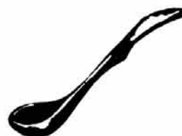
Top, left to right; #1425 1/2, #352. Bottom: #351, #1485, #1 spoon.