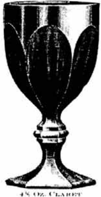
4 1/2 OZ. CLARET