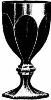
3 1/2 OZ. BURGUNDY