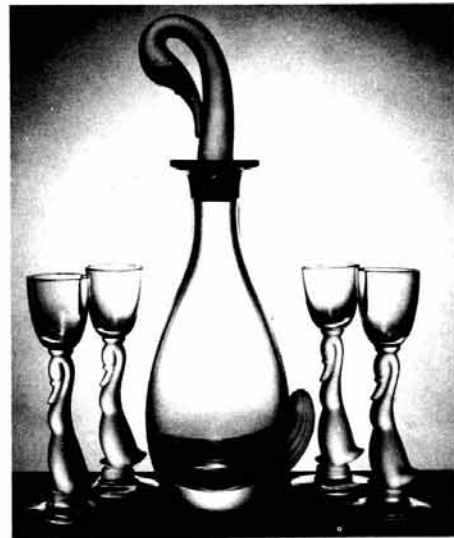
GOOSE CORDIAL SET Decanter — 11 3/4" high Cordial — 5 3/4" high