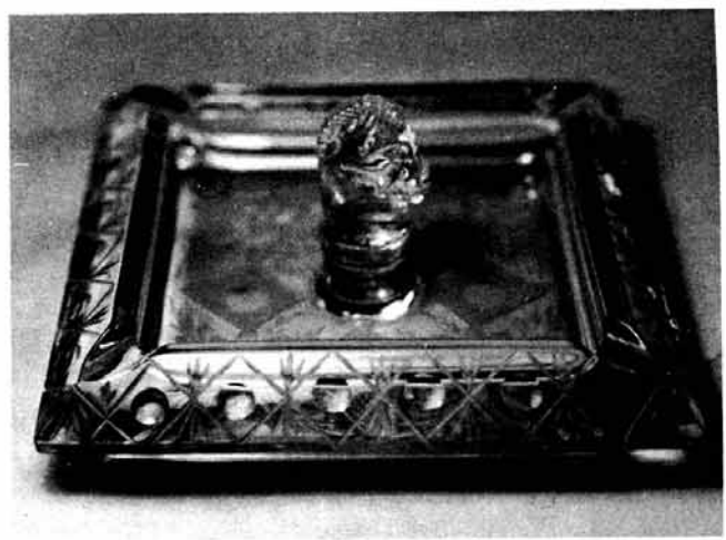
HORSEHEAD ASH TRAY 8" square