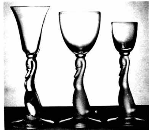
SHERRY 6 1/2" high GOOSE STEMS COCKTAIL 6" high CORDIAL 5 3/4" high