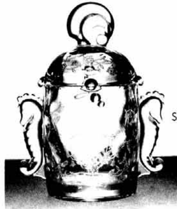
SEA HORSE HANDLED CIGARETTE 5½" high