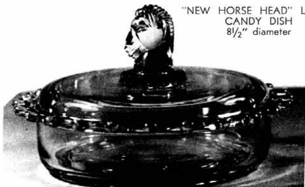
"NEW HORSE HEAD" LARIAT CANDY DISH 8 1/2" diameter