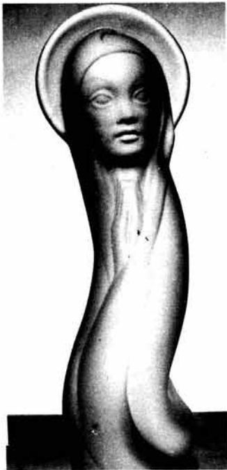
MADONNA 11" high