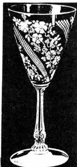
Below: #3389 Duquesne goblet with #480 Normandie etch.