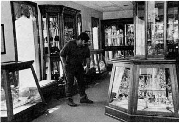
A museum visitor enjoys the splendor of the glass.

Far right: The King House dinning room table was set to reflect individual ads. The theme of course, Making a Mark in the Glass Industry: Heisey Advertising.