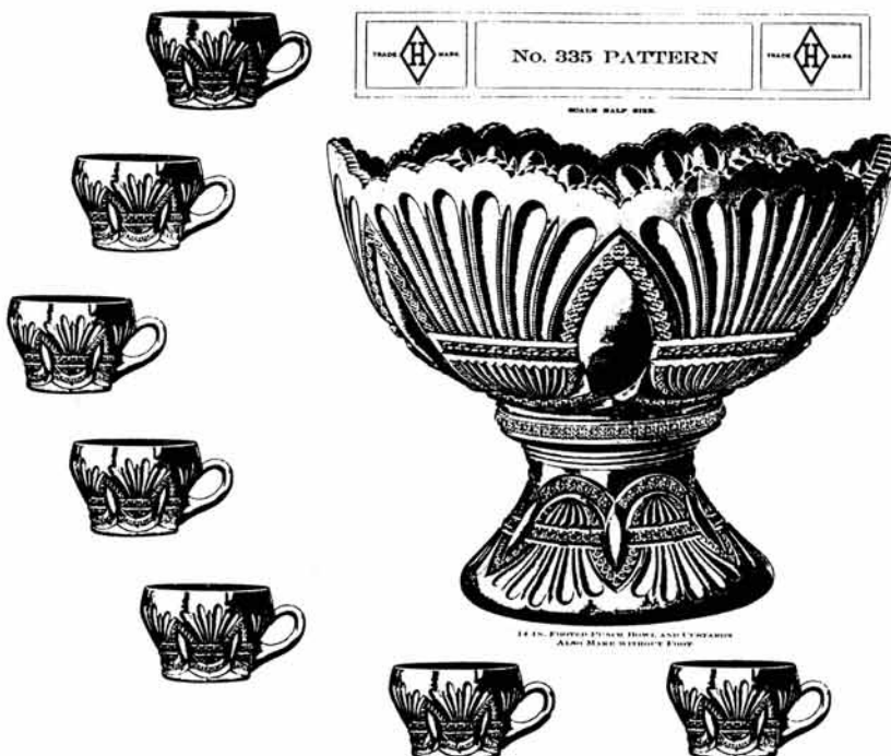
Punch Bowl from Catalog 56, 1909.

There were few changes in items price-listed between 1902 and 1906. The number of items offered declined rapidly between 1908 and 1910, and price list #175 issued in 1913 made no mention of the #335 pattern. ♦