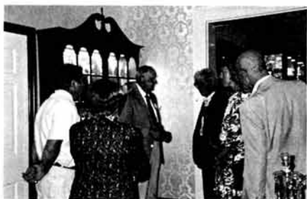
Visitors from other Newark's (above) enjoyed viewing the #3404 Spanish goblet named in honor of the last reunion held here.

It doesn't help matters any that we've had a whirlwind of events here in the past month. Week after week of excitement and days chock full of visitors. Sure we have some sleepy days here and there, but they're just breathers between tours.