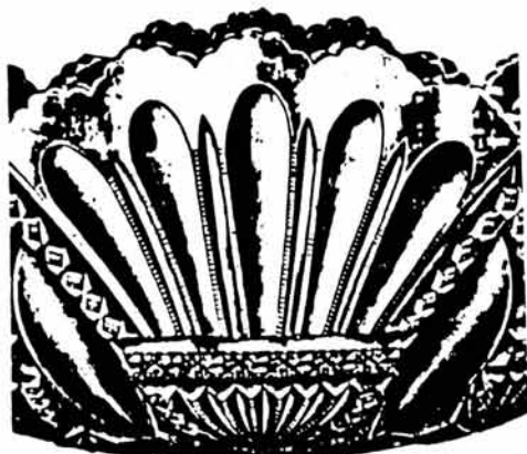
Detail of plume design.