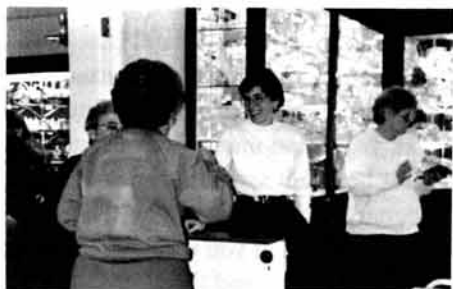
Museum Volunteers for March