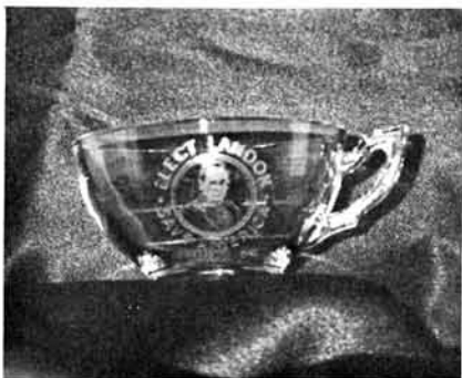
As a result of the article in Nov. H. N., a member donated this #1184 Yeoman cup w/ #9036 Alf Landon etch.