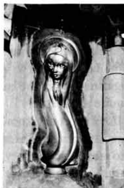
#2 Madonna mold

One Sunday afternoon recently, as a group of committee members were sorting through the molds in the warehouse, we made some interesting discoveries. When HCA purchased the molds from Imperial in 1985, some of the original Heisey animal molds were not listed on the inventory listing. It turns out that the long neck goose mold was marked SWAN. Only by opening the mold, did we discover that we do indeed have all three geese. The ring in the Doehead mold was marked gazelle, and the #2 Madonna was simply marked madonna. These three molds have never been used by HCA in part because we didn't know we had them.