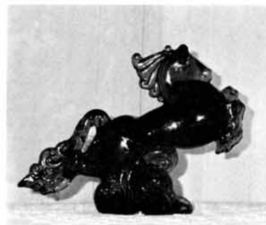
Flying Mare made by Dalzell Viking for HCA.

So, how will these trial run Flying Mares be sold? Will more emerald Flying Mares be produced? Will it be included as part of the next animal series? Or, will it be offered as a separate item, not a part of the series but as an Add-on for that series? These questions and more are all to be answered by the committee and the Board of Directors in the near future. Stay tuned, HCA!