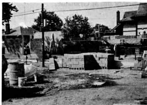
Work begins on the second story.

The fall days here in central Ohio have been warm and sunny and the nights cool, clear and crisp. The trees are getting more colorful every day. This beautiful fall weather has enabled our construction workers to make good progress on the museum addition. The concrete for the second floor has been poured and as I write this, the second story cement block walls are being built.