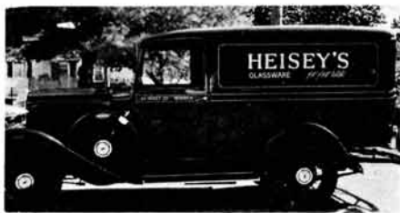
Ca. 1930 Chevrolet panel truck made an appearance in the 1992 Flint Festival Parade. Though not an original Heisey Co. truck, it was restored about 15 yrs. ago by a local Newark man who copied the Heisey advertising from a photograph he had seen.

The daily operation of the club has kept the focus on meeting operational expenses. When the Endowment Fund was formed, there was no formal push to increase it until 1988 when plans were made to focus attention to the fund and make it grow more rapidly. The people of Heisey collecting have been very resourceful in a short time to have done all of the things they have done financially, along with making it the most secure and safe collectible when they purchased the original existing molds, bought a warehouse for these molds and continued to grow in other ways. It is hoped each of you will consider how you can join in with your help to make this fund grow rapidly. All gifts are 100% tax deductible. If you need any information or help in making a gift, you are welcome to contact members of the Endowment Fund Committee. Members are: Bob Ryan, Chairman, Amy Jo Jones, Co-Chairman, Curt Guilmette, Charlie LeBlond, Chuck Jones, and Carl Sparacio. Contact HCA for assistance in locating any of the members.