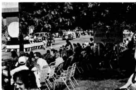
Spectators gathered on the Heisey Museum lawn to watch the annual United Way Parade which traveled along Church St towards downtown.

Proceeds from this mini auction will be split--half to the Building Fund and half to the Endowment Fund.