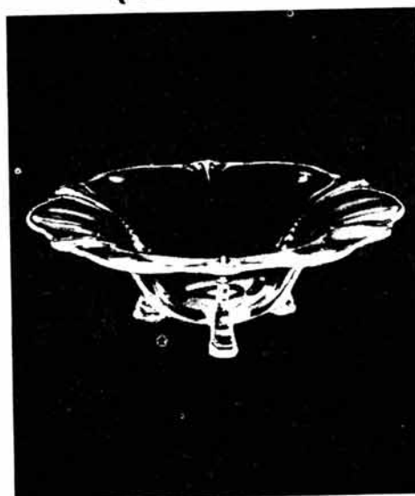
No. 1509—11 in. Ftd. Floral Bowl