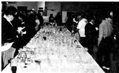
Heisey galore at the March Benefit Auction.