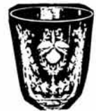
#503 Minuet etch #515 Heisey Rose etch #507 Orchid etch