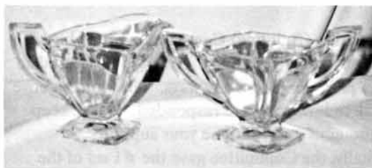
#8087 Rarey Cream and Sugar

In past issues of the newsletter I have mentioned the need to increase awareness of the museum in the local community. With much press coverage of the expansion plans and all of our fundraising projects, there has been a renewed local interest in HCA activities, but there is still more to be done. This past week I spoke at a meeting of a local Kiwanis club. Of the approximately 20 people there, not one had visited the museum despite the fact that they all knew something about Heisey, had many good questions, and were genuinely interested in the organization. They were all impressed with what HCA had accomplished to date and with our future plans. It is always a good reminder to talk to such people and to hear their ideas about the role of our museum within the community.