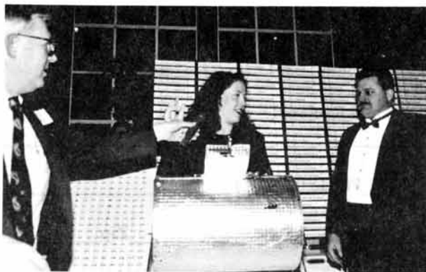
The first number was drawn

Throughout the evening, numbers were drawn and names called and as we came closer and closer to the last five numbers the Las Vegas part of the evening ended and everybody gathered around to see WHO the lucky winner of the Big Prize would be!