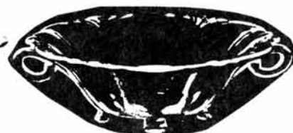
#1509 Queen Ann