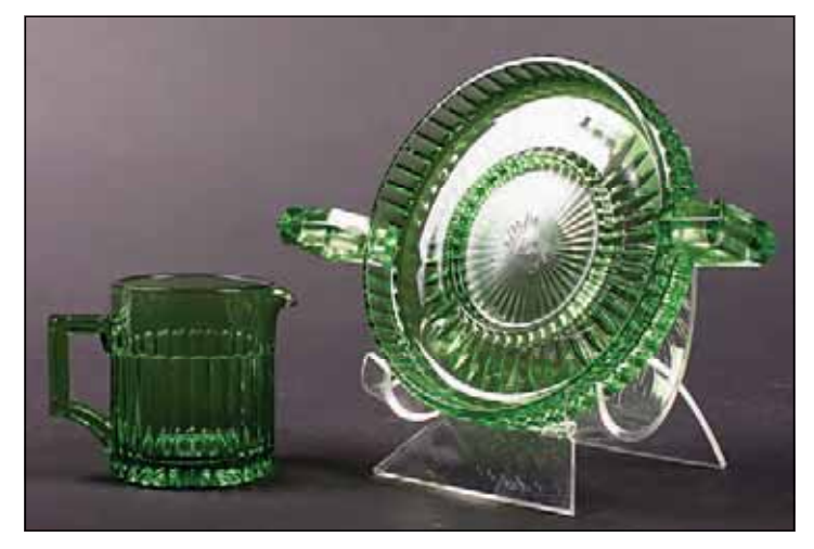
4-oz. individual cream with 5-in. dice sugar tray.

The hotel cream served another purpose in this pattern. You may recall in the Domino sugar article (April, 2013) I mentioned that there was one Domino sugar that Heisey didn't call by that name. That is the tray in the loaf sugar and cream set . There is no question that the set was intended for Domino sugars. A Heisey ad from 1921 (see p. 22) shows the loaf set holding them, all perfectly arrayed around the cream in the center, fitting just so. I don't know why Heisey abandoned the term "domino." If anything, Heisey added confusion. Even more exasperating, a 1915 ad shows what is labeled a loaf sugar holding, not Dominos, but cubed (dice) sugar. Possibly the 1915 ad mislabeled the set, or possibly Heisey didn't really care what you put in them.