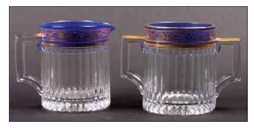
Hotel cream and sugar, unknown decoration similar to Wheeling D-2.

Marmalade: Unusual in having no spoon slot, this could be mistaken for a table sugar.