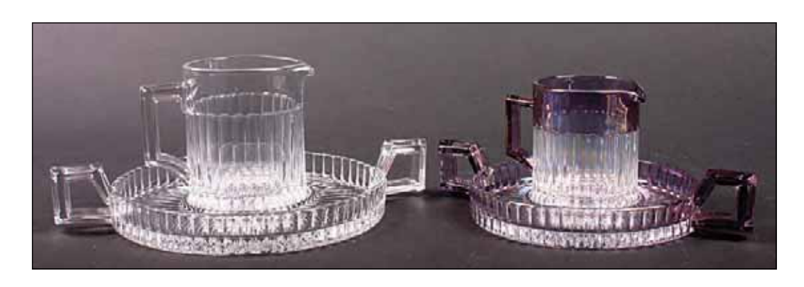
Loaf sugar and cream set (hotel cream and 6-in. tray); dice sugar and cream set (4-oz. cream and 5-in. tray).

of course, the dice sugar tray needed a cream. The hotel cream was too large, so Heisey created a 4-oz. individual cream to go in the center. This cream has no free-standing individual sugar partner. The cream was sold either separately or as part of the dice set but that was all. Just as the dice sugar is a miniature of the loaf sugar, the 4-oz. cream is scaled down from the hotel cream. Just like the larger piece, the smaller cream is straight-sided with a hand-pulled spout. The dice set is available in Moongleam, usually in one of the early, deep shades that are nearly indistinguishable from Emerald, sometimes even glowing as brilliantly under ultraviolet. There is a collector's price guide listing the set in Flamingo, but I suspect that is theoretical only. Price List 209 goes to some trouble to show a number of items available in both Moongleam and Flamingo, carefully omitting Flamingo mid-list when it gets to the dice sugar and cream set. I'm sure one of you will gleefully correct me if you have a Flamingo set at hand. A couple of Heisey's price lists raise the interesting possibility that the Moongleam dice sugar was offered with a crystal cream, but I see no evidence for it the other way around.