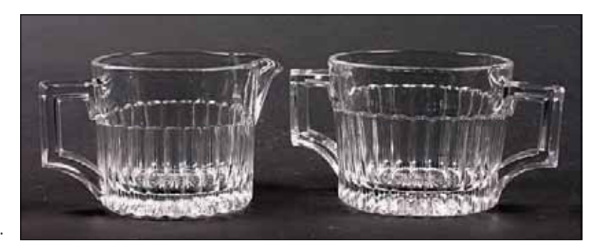
3-oz. individual cream and individual sugar.

Not willing to leave well enough alone, Heisey made two other creams that were called individual, each with an accompanying sugar. There was the 3-oz . individual cream and sugar set and the squat individual sugar and cream set . We've already looked at the squat set, because this is none other than one of the stacking sets mentioned back in February, 2013. I've already pointed out in that article how the squat set is unusual in having rounded handles, rather than the square ones favored for most of the Narrow Flute with Rim pattern. The 3-oz. individual cream and sugar set is somewhat taller and has square handles, so can't be confused with the squat set. On the other hand, the 3-oz. cream is shorter and blockier than its 4-oz. counterpart, so there should be only minimal chances for mixing up those two. The 3-oz. cream has a moulded spout, although the very tip is probably hand-pulled. Both the individual sugar and cream taper outward slightly, so the tops are wider than the bottoms. The round-handled squat set taper inward slightly.