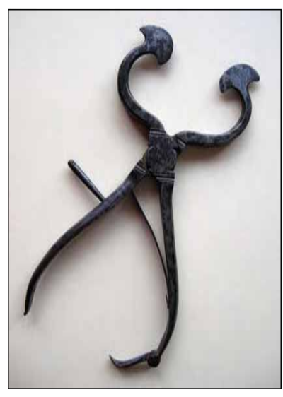
A sugar loaf and sugar nips.