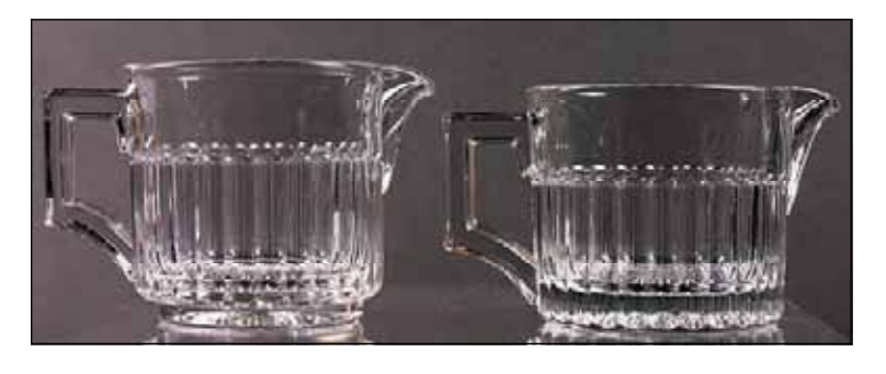
Individual syrup (left) and 3-oz. individual cream.

not a great deal. Some of the tray sets are found partially or entirely iridized, and almost any of the cream or sugar pieces can be found with various enamels applied to the rims. The cheese and cracker that everyone calls a strawberry and sugar is often found with cuttings, but none of these, so far as I know, originated at the Heisey plant.