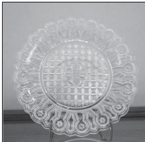
8071 Sandwich Hairpin

The Acquisition Committee also made a few purchases of items to enhance our collection. An 8071 Sandwich Hairpin 8" plate was the first item. This is one of a series of Sandwich Glass inspired plates that were developed in the mid-1920s. This one was not shown in any company catalogues and is so rarely seen that it is felt that it was never put into regular production; instead it was only developed as a prototype and very few were ever made.