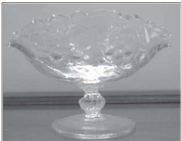
1519 Waverly Oval Nut Compote 965 Narcissus Cut