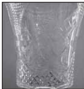
Detail Monte Cristo