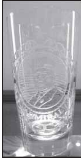
2401 Oakwood with Admiralty Etch

The second purchase was a 2401 Oakwood 12 ounce soda with Admiralty deep plate etch. The Admiralty etch was not known at the time of the production of the etching book so you will not find it listed in that reference. It was probably done for a specific customer. The etch is of an imposing figure in a naval uniform within an oval frame, under the frame is the caption "Admiral." A variant of 3 Motor Boat etch is used on the remainder of the piece.