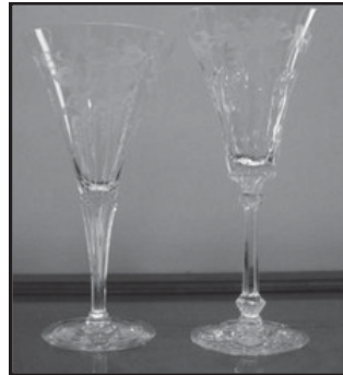
4060 Ridgeleigh & 3368 Albemarle