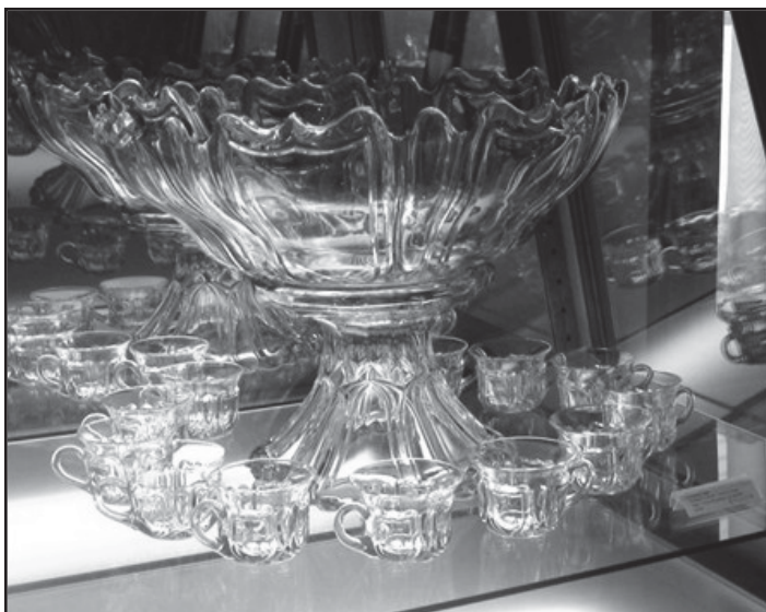
365 Old Queen Anne Flared Punch Bowl