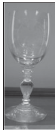
Coventry Goblet (above) and with detail etching (below)