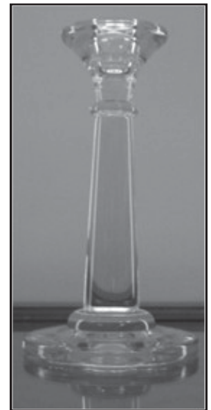
20 Sheffield 7" Candlestick

A 20 Sheffield 7" candlestick was also purchased. This candlestick comes in six sizes, with the 9" version with a Moongleam top being the hardest to find (although none of them is easy to locate). The 23 Sheffield (Standard) is a very similar candlestick, the difference being that the number 20 has a tapered column while the number 23 has a straight column.