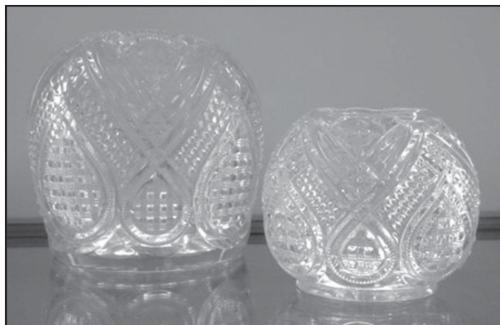
1205 Fancy Loop Rose Bowls