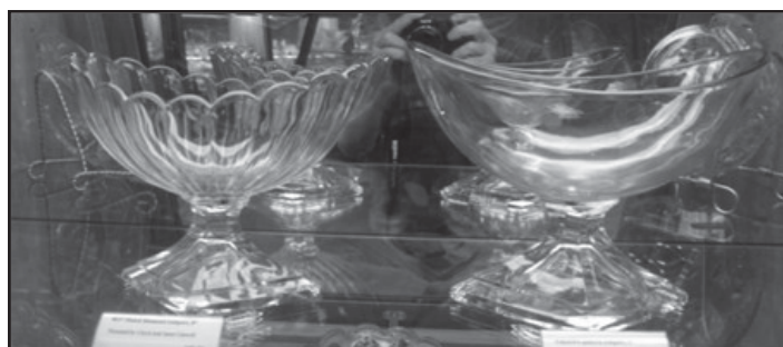
8037 Fluted Diamond and Unknown Pattern 8" Compote

The Acquisition Committee also made a few purchases of items to enhance our collection. An 8071 Sandwich Hairpin 8" plate was the first item. This is one of a series of Sandwich Glass inspired plates that were developed in the mid-1920s. This one was not shown in any company catalogues and is so rarely seen that it is felt that it was never put into regular production; instead it was only developed as a prototype and very few were ever made.