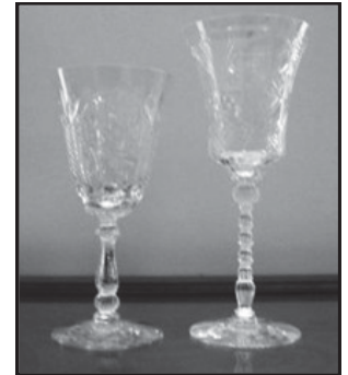
3408 Jamestown & 3411 Monte Cristo

A 20 Sheffield 7" candlestick was also purchased. This candlestick comes in six sizes, with the 9" version with a Moongleam top being the hardest to find (although none of them is easy to locate). The 23 Sheffield (Standard) is a very similar candlestick, the difference being that the number 20 has a tapered column while the number 23 has a straight column.