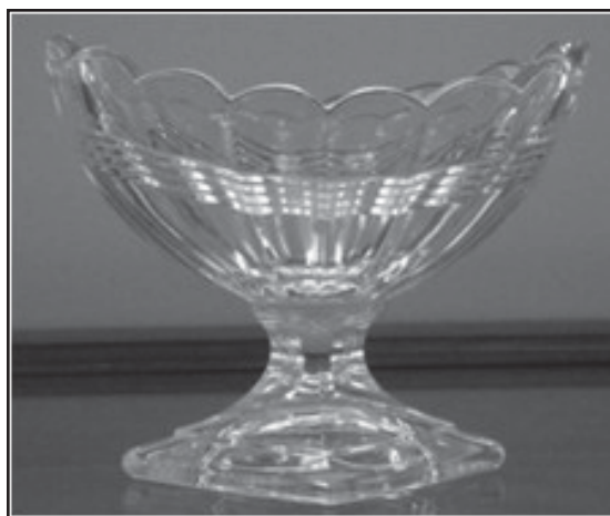
8025 Banded Diamond Compote