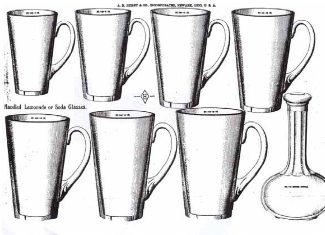
Top row: No. 538 6 oz., No. 539 8 oz., No. 540 10 oz., No. 541 12 oz. Bottom Row: No. 542 13 oz., No. 543 14 oz., No. 544 16 oz., No. 1115 Bitter Bottle