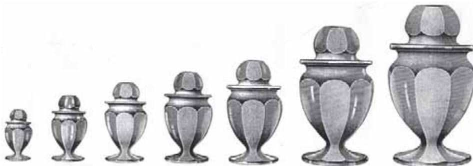
No. 354 Colonial Lavendar Jars ♦