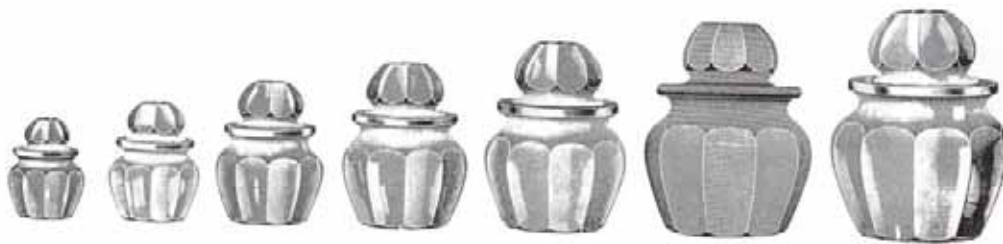
No. 352 Lavendar Jars

All the lavender jars have ground-in stoppers. This makes them air tight when closed. To me, the jars could be used for almost any other purpose such as spice jars, jelly jars, tobacco jars, etc.