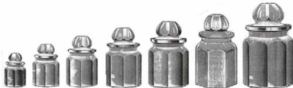
No. 353 Colonial Lavendar Jars