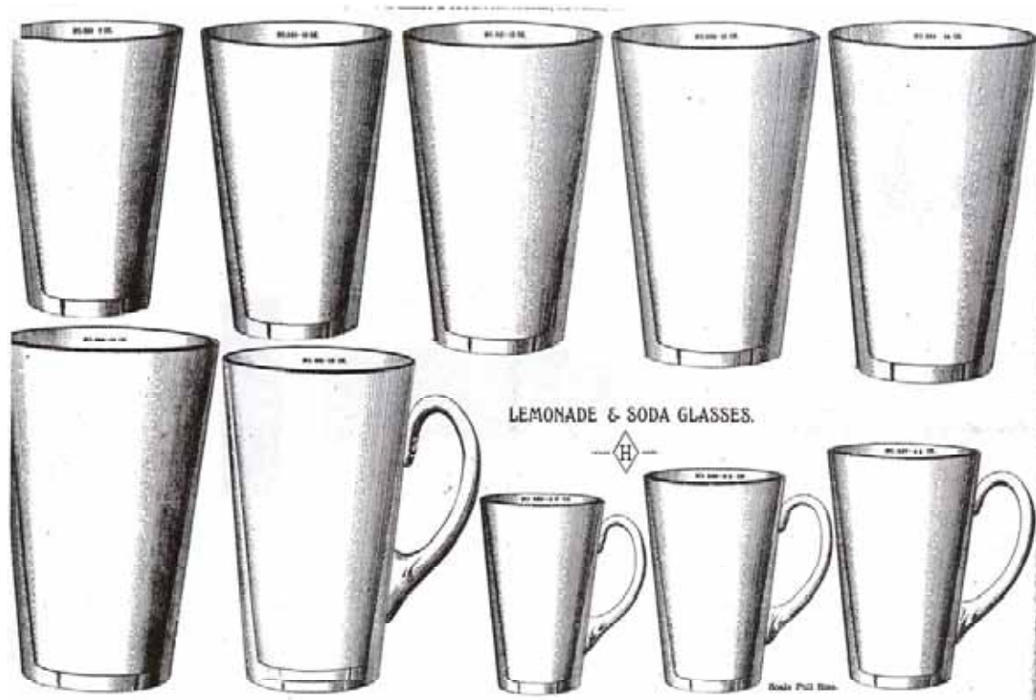
Top row: No. 529 8 oz., No. 530 10 oz., No. 531 12 oz., No. 532 13 oz., No. 533 14 oz. Bottom row: No. 534 16 oz., No. 521 12 oz., No. 535 2 ½ oz., No. 536 3 ½ oz., No. 537 4 ½ oz.