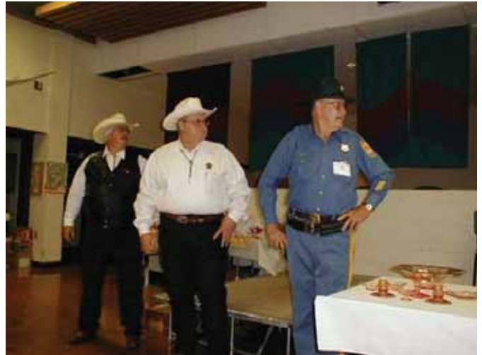
Move over "Montes" it's the Heisey Lawmen