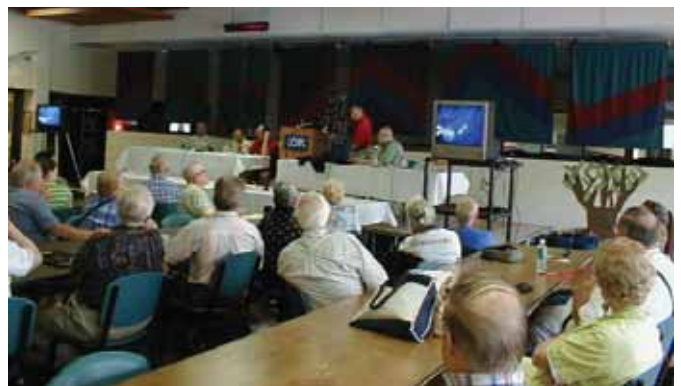
The ID Session continued its popularity

Plan to join us next year at the Former Employees' Reunion. ♥