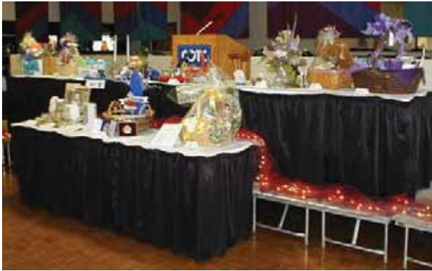
Some of the centerpieces that were up for auction