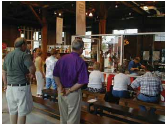
Attendees always enjoy the glassblowing demonstrations at The Works.