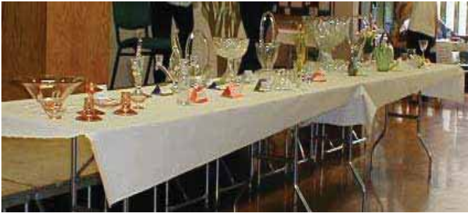
Some of the beautiful pieces donated for the Blind Auction

Every successful event is backed by a group of high energy and committed individuals. The song that goes, "I love those dear hearts and gentlepeople," is representative of the volunteers that truly made the Blind Auction a fun and profitable evening.