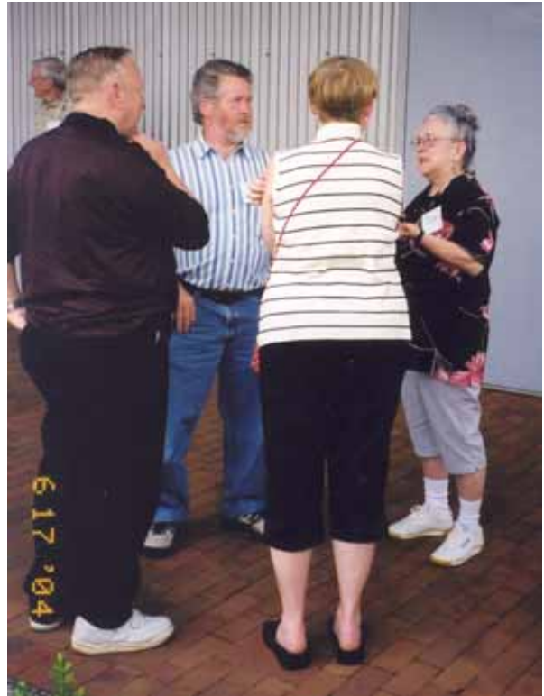
Attendees gather outside of The Works before the Cookout