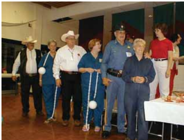
The couples category