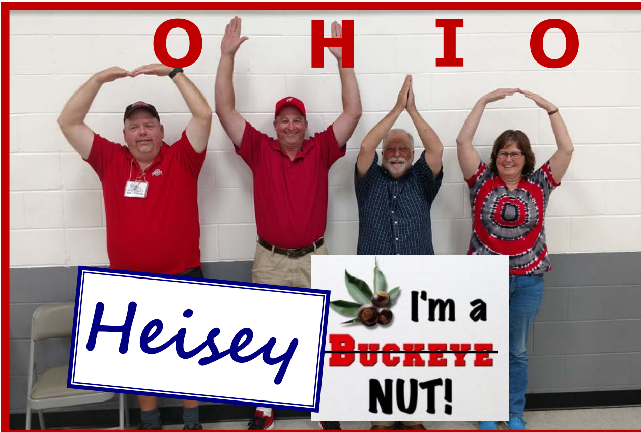
Auction day was a GAME-DAY after-all... Our two Auctioneers in the center and two hard working auction volunteers take a break to demonstrate that "OHIO Thing".

Come at your leisure to enjoy more than 6,000 pieces of glassware produced by A.H. Heisey and Company from 1896-1957. Hundreds of patterns are featured in all production colors. Rare and experimental items are included as well. Facilities are air-conditioned and handicapped accessible. The opinions expressed in articles in HEISEY NEWS are those of the authors and not necessarily those of the organization. The Editorial Staff reserves the right to edit, with or without the consent of the author, or to refuse any material submitted for publication.