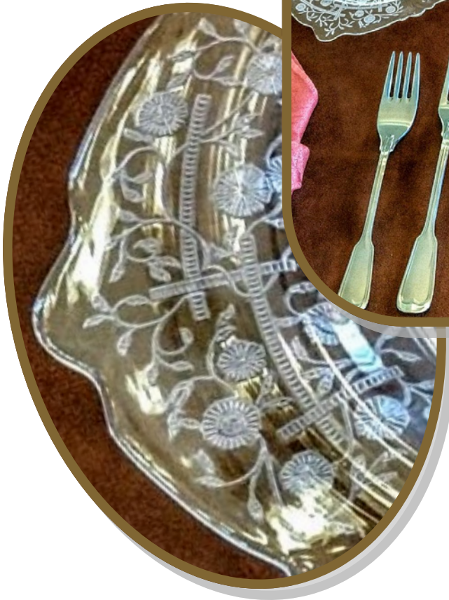
The King House Dining Room table is graced with the Museum's collection of Olympiad etch #458, creating a beautiful Fall table for any occasion.