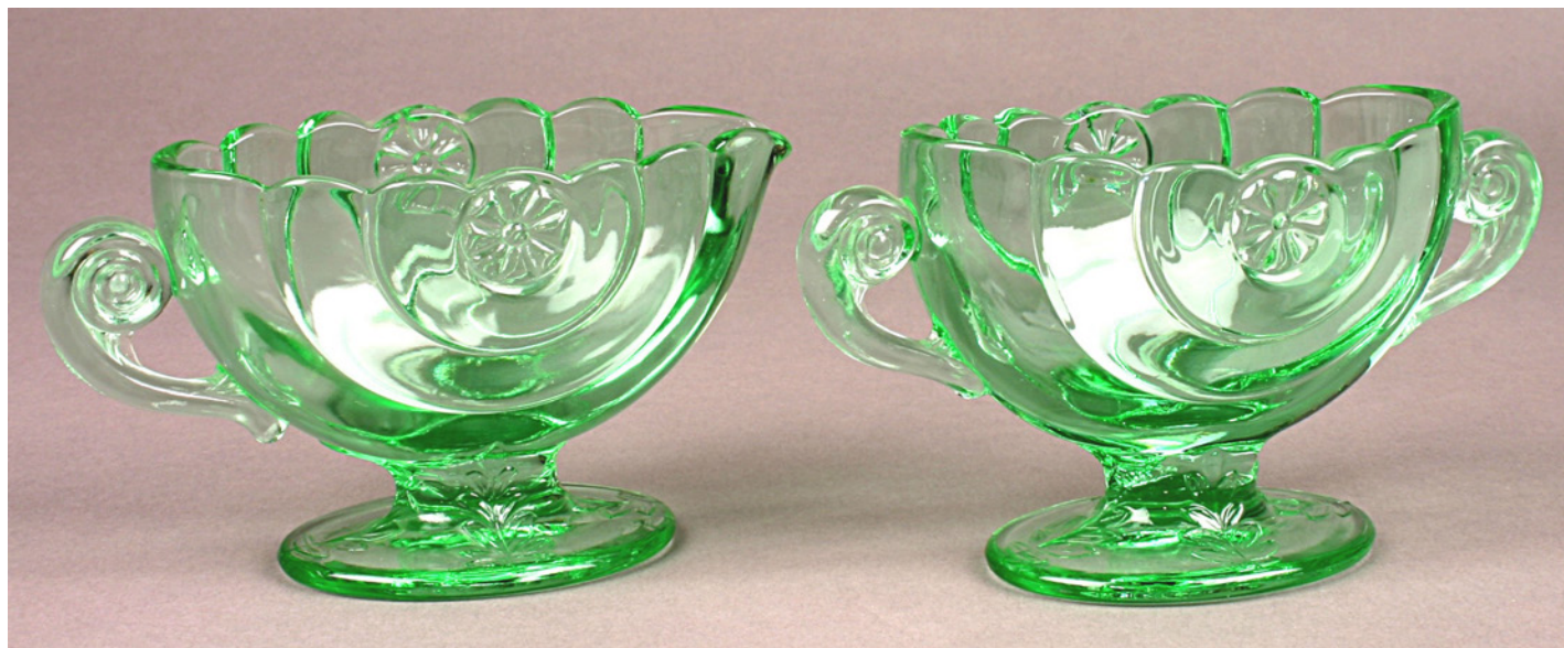
Fig. 1. #1403 Half Circle cream and sugar, Moongleam

Heisey could be of two minds (or three, or four) about a pattern. Hamlet had nothing on them. The company could throw several disparate items into one pattern, leaving us searching for what may have been the common thread. Other times, items that were so similar that surely they should go together were instead given wholly separate identities, as though they were placed in some witness protection program.