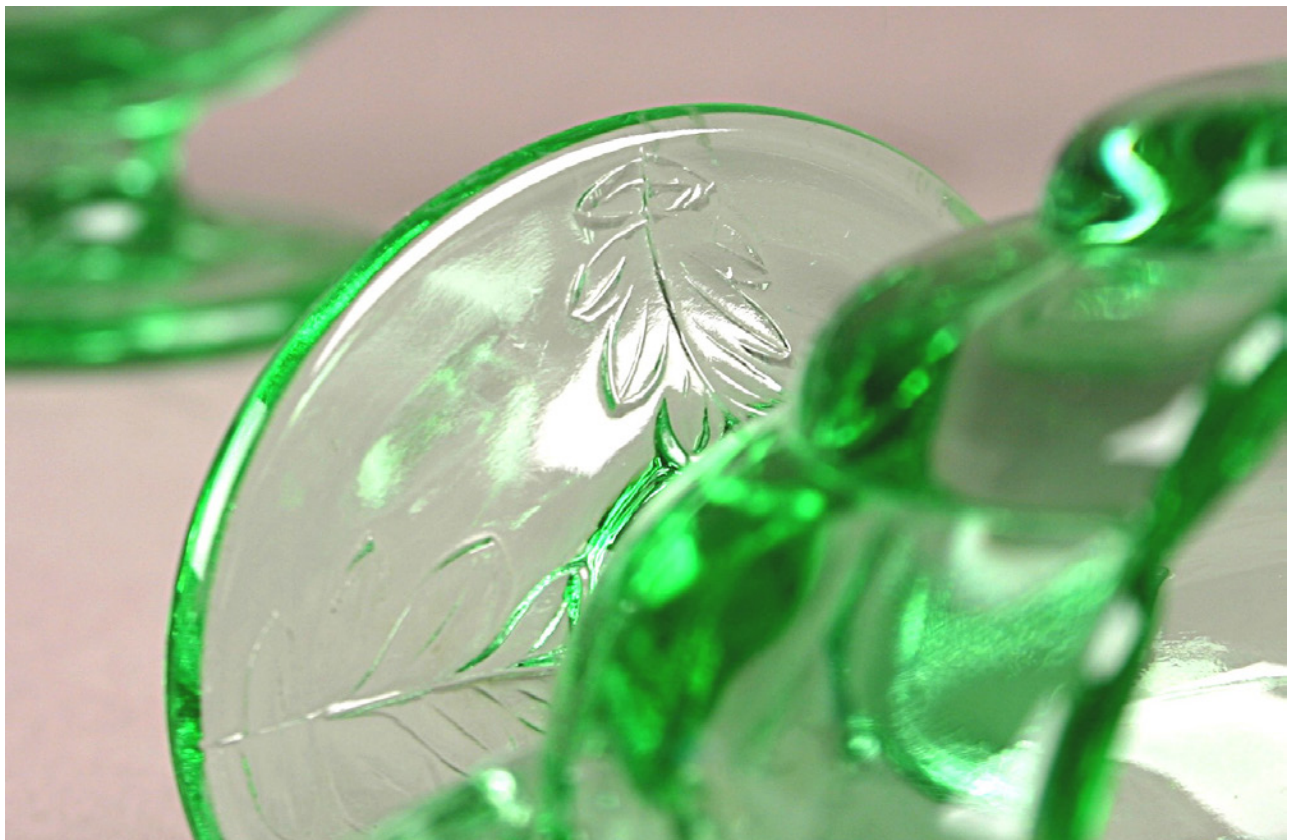
Fig. 2. Leaves on base of Half Circle, a detail sometimes overlooked.

The Dowager grapefruit (fig. 3) seems to have been made later than the Half Circle sugar and cream, even though the number indicates otherwise. Relying solely on the pattern number, one would think that Dowager should have been made starting around 1930. I have seen it listed in factory material, however, only from around 1938 and forward into the war years. By that time, the Half Circle cream and sugar set was no longer offered. There is at least one reference that places Dowager in 1928, when Art Deco still reigned supreme. Judging from the Moderne style of the piece, 1938 looks more probable and I'd guess the 1928 date is a typographical error. Either that, or I've simply failed to find earlier documentation when someone else had better luck.