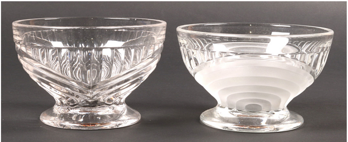
Fig. 3. #1403 Dowager grapefruit, one rotated quarter-turn from the other. Example on right has frosted arches, possibly done at the factory.

Neither the Half Circle cream and sugar nor the Dowager grapefruit are known for decorations. The frosted example of the grapefruit shown here may well have been done in the Heisey factory, but is not documented.