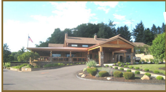
Above: It was a beautiful day for a banquet, hosted at the Newark Trout Club