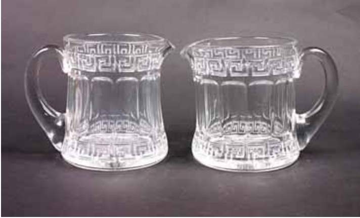
Fig. 3. Greek Key jugs #433 (left) and #4331/2

"Well, all right," you may be saying. "But show us the proof. So far it just sounds like speculation to me." Or you may think, "Are you just now figuring that out? I've known that for years." If you're in the first camp, you can call my bluff and read on. If you're in the second, you can call me a late bloomer and do as you like.