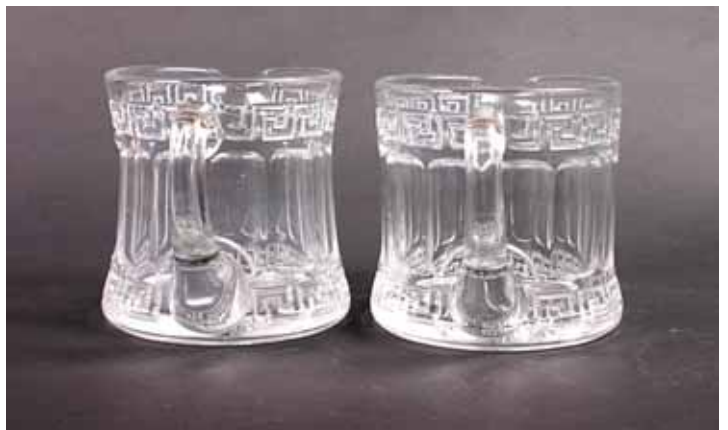
Fig. 4. The Same Greek Key jugs, handles facing Greek Key jugs

The jug on the left is #433, the jug on the right is #433½. As you can see, the differences aren't great, but they are real. More importantly, the differences are exactly those that the drawings were trying to put across.