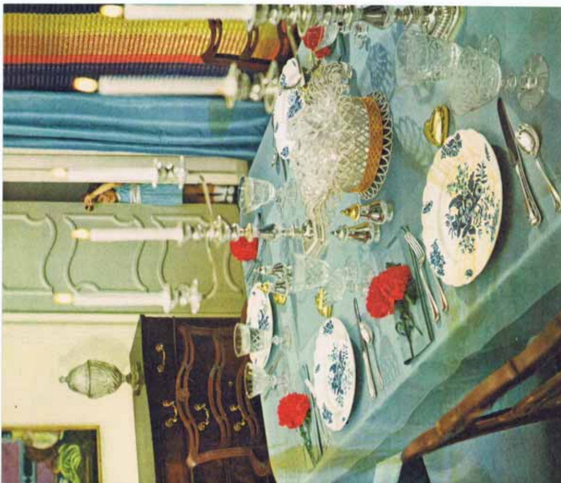
A beautiful spring table set with 5024 Oxford stems with 964 Maryland cutting as advertised in the May 1950 issue of House and Garden

The opinions expressed in articles in HEISEY NEWS are those of the authors and not necessarily those of the organization. The Editorial Staff reserves the right to edit, with or without the consent of the author, or to refuse any material submitted for publication.