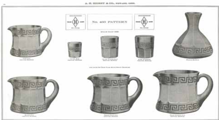
Fig. 1. Catalog 75, page 246

Page 246 of Cat. 75 shows the jugs, four sizes, under #433. See Fig. 1. Turn over to p. 253 of the same catalog (Fig. 2) and there are four more jugs shown under #433½; they display only slight differences from the first set. Are the differences real, or is it just two sets of drawings that don’t quite match?