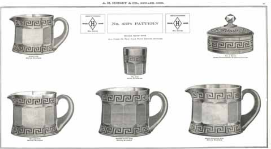
Fig. 2. Catalog 75, page 253

Examine the drawings closely and it appears likely that the jugs shown on the two pages were drawn by different people. For one thing, the shading techniques differ. The artist of the #433 jugs, for instance, showed the handles with subtle shading, whereas the artist who drew the #433½ jugs preferred more striking, sharper highlights and he put them in other places. (Each artist was responsible for individual drawings, not entire pages. One non-jug drawing was used twice on these pages. Right in the middle of the #433½ page, Heisey shows a #433 tumbler, clearly labeled as such, and it is the very same illustration as shown on the #433 page. The intent was probably to show the prospective buyer that, regardless of which jug