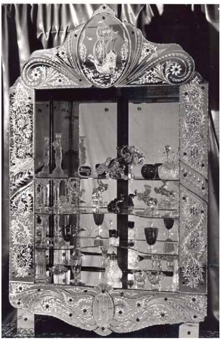
The Krall Cabinet Returns to Newark – See Stories on pages 3 and 5

Volume XL No. 9 September 2011 ISSN 0731-8014