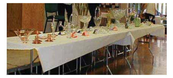
Some of the beautiful pieces donated for the Blind Auction

Every successful event is backed by a group of high energy and committed individuals. The song that goes, "I love those dear hearts and gentlepeople," is representative of the volunteers that truly made the Blind Auction a fun and profitable evening.