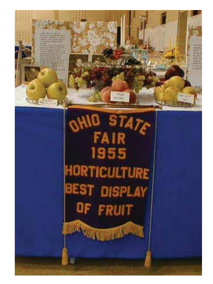
Editor's Note: Included in Dick's display were several photos of his Grandfather, beautiful fruit, and the prized banner showing, "Best Display of Fruit."

This is a small example of how the display would look.