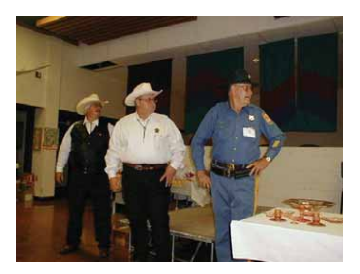
Move over "Montes" it's the Heisey Lawmen