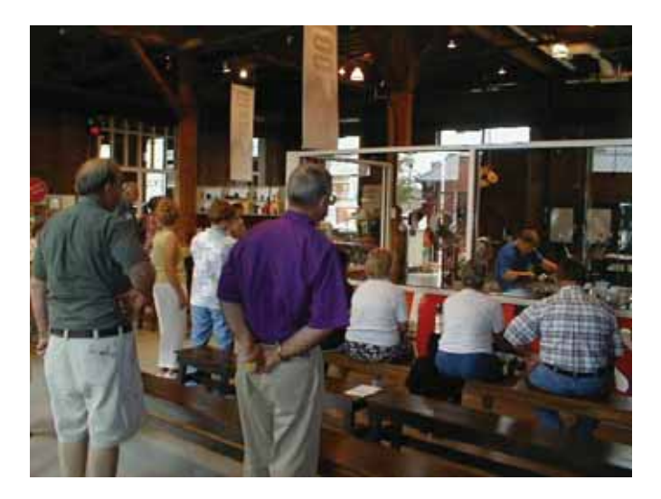
Attendees always enjoy the glassblowing demonstrations at The Works.