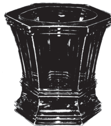
Number 379 Urn

The decanter stands 8" tall with the top and 6 1/4" without. The stopper is a single piece. The example in the Museum has the stopper stuck into it and it could not be dislodged. The bottom of the stopper has a 1 1/4" recessed section to allow for pouring when positioned beside the pour spout incorporated into the bottom. Turning the stopper away from the pour spout would make a seal allowing the shaker to be shaken mixing the ingredients of the cocktail. The