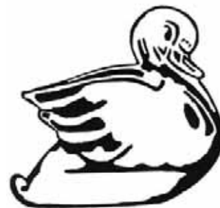
Cygnet from the Activity Book 1

I just had to add this about our latest find. We were at a depression glass show looking around and saw what we thought was a puff box with a lid. We looked at it to check the price because we have one. Upon reading the tag it said it was a soap dish. Well, that got our attention. Looking inside, we wanted to see what made it a soap dish and found the ridges in the bottom to drain the water from the soap. That sold us, we could not leave without it and the price was right. When we got home we looked it up in the books, it is a medium flat panel number 353. The books say Heisey only made this one soap dish. We have collected for over thirty years and had never seen one, we feel blessed to have this one. ♥