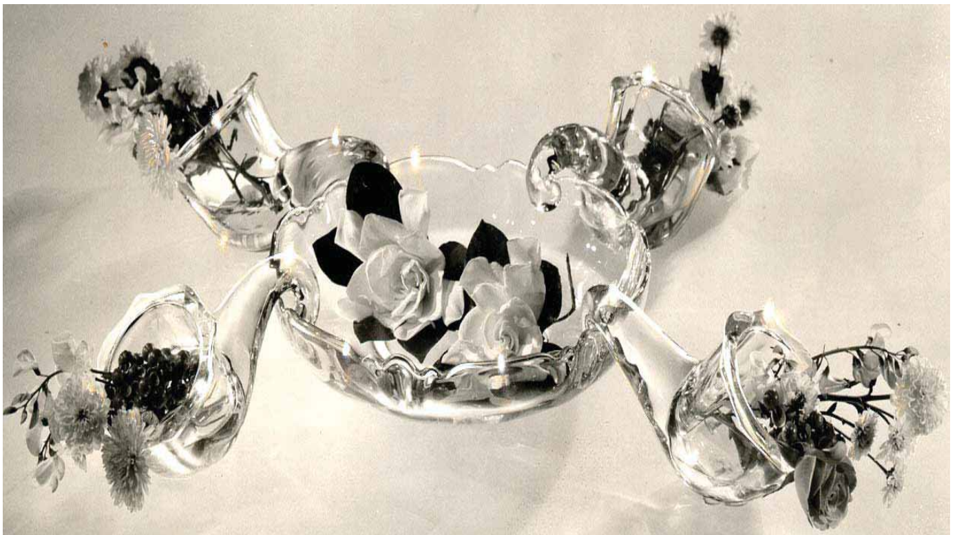
A 1509 Queen Anne Gardenia Bowl surrounded by 4-1519 Waverly Horn Vases