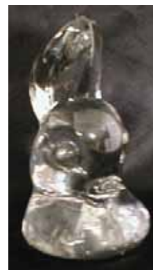
Doe Head in crystal

Price _____ x $65.00 @ = _____ OH Tax ID#: _____ Tax (OH Only): _____ x $4.55 @ = _____ Shipping & Handling _____ x $7.00 @ = _____ TOTAL = _____