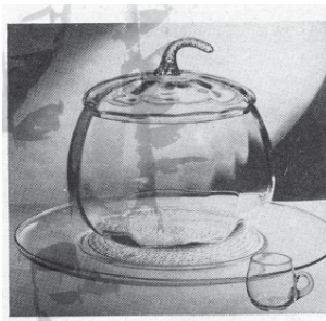
• SOMETHING NEW in punch bowls from A. H. Heisey: a glass pumpkin with stemmed top. Set comes complete with tray and tiny punch cups

How many of you have heard of Heisey's "Pumpkin" punch bowl? I While looking have. through the Fall 1935 issue of "Creative Design in Home Furnishings," I came across the following Heisey "Something new in punch bowls A. H. Heisey a pumpkin glass with stemmed top. Set comes complete with tray and tiny punch cups." A copy of the ad is shown with this article.